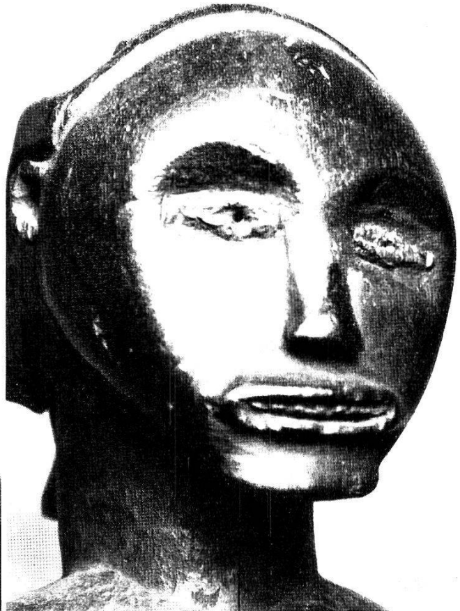
Fig. 3 b.