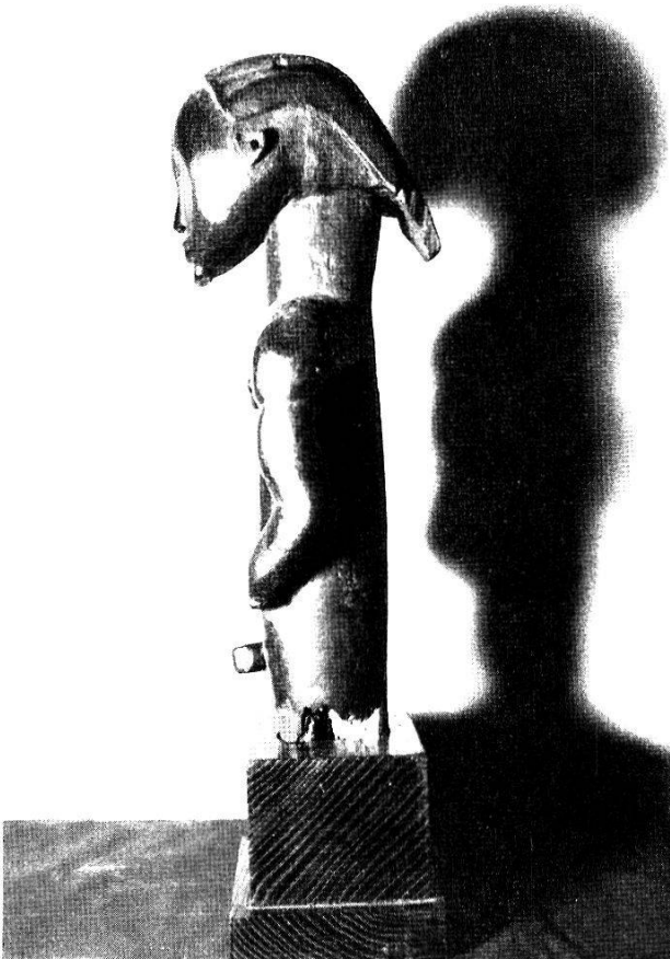
Fig. 3 a.