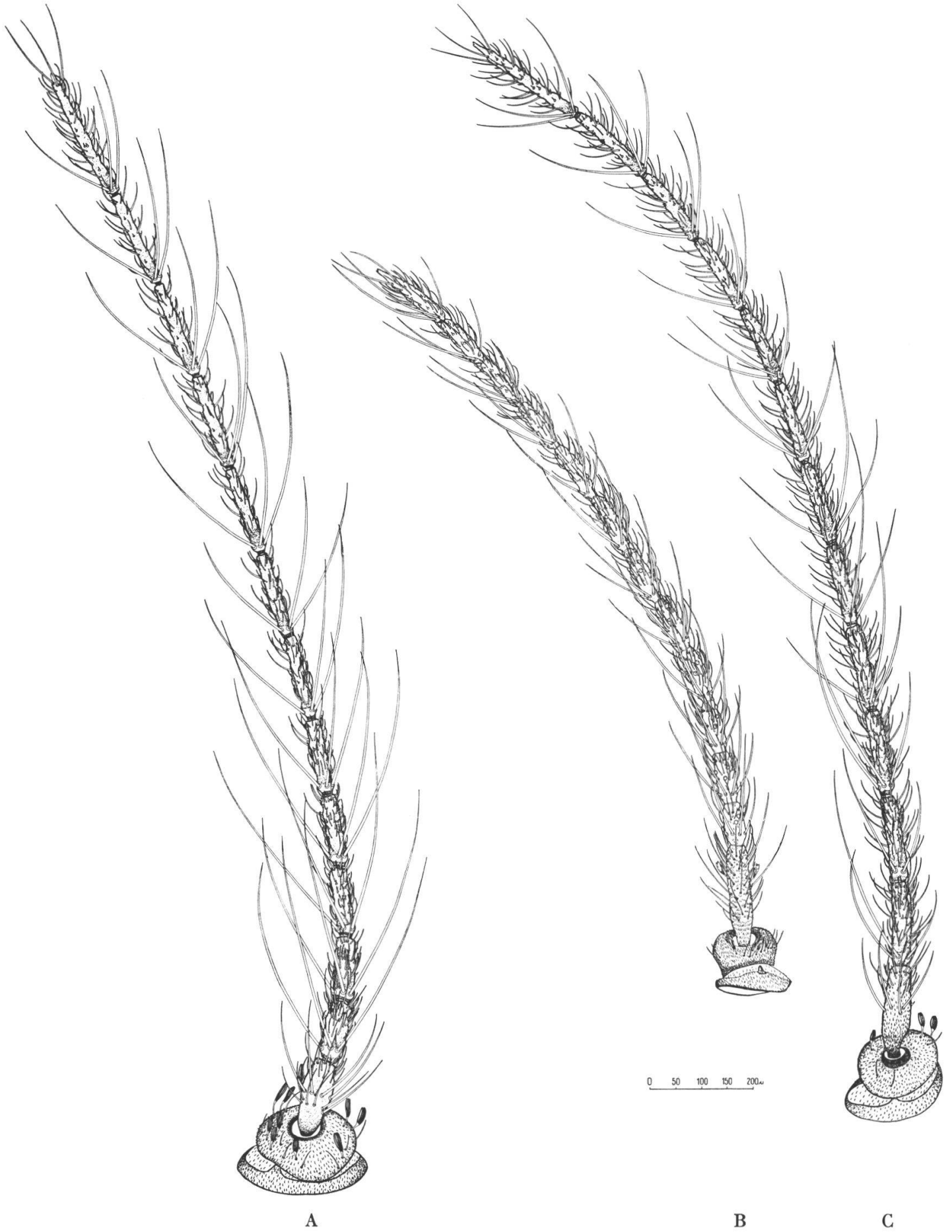
Fig. 1. Antennae of female mosquitoes with the sense organs distributed on their walls. A: Aedes aegypti . B: Anopheles maculipennis . (Drawn from ISMAIL, 1962.) C: Culex pipiens . Magnification 700 ×.