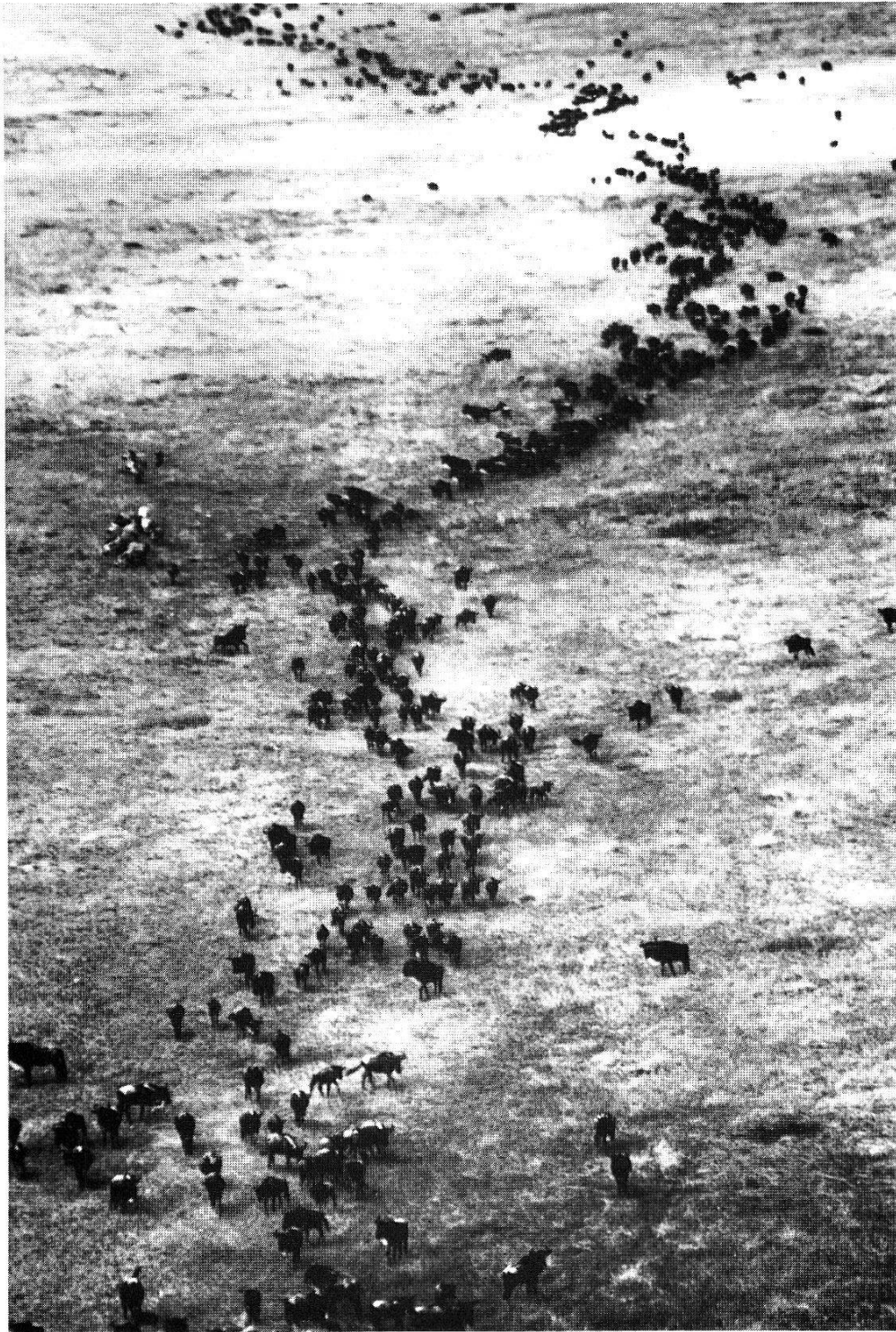
Fig. 3. Migrating wildebeest in the Serengeti National Park, Tanzania. Parts of their migration routes are outside the Park. To improve conservation of big game new park boundaries have to be established.

Assistance was also given to extending the Arusha National Park . In 1962 funds were contributed to purchase parts of the former Momela Farm. Together with other land this was added to the Ngurdoto Crater National Park. In 1964 the forest land between Momela and Ngurdoto was also included in the Park. When further substantial portions of