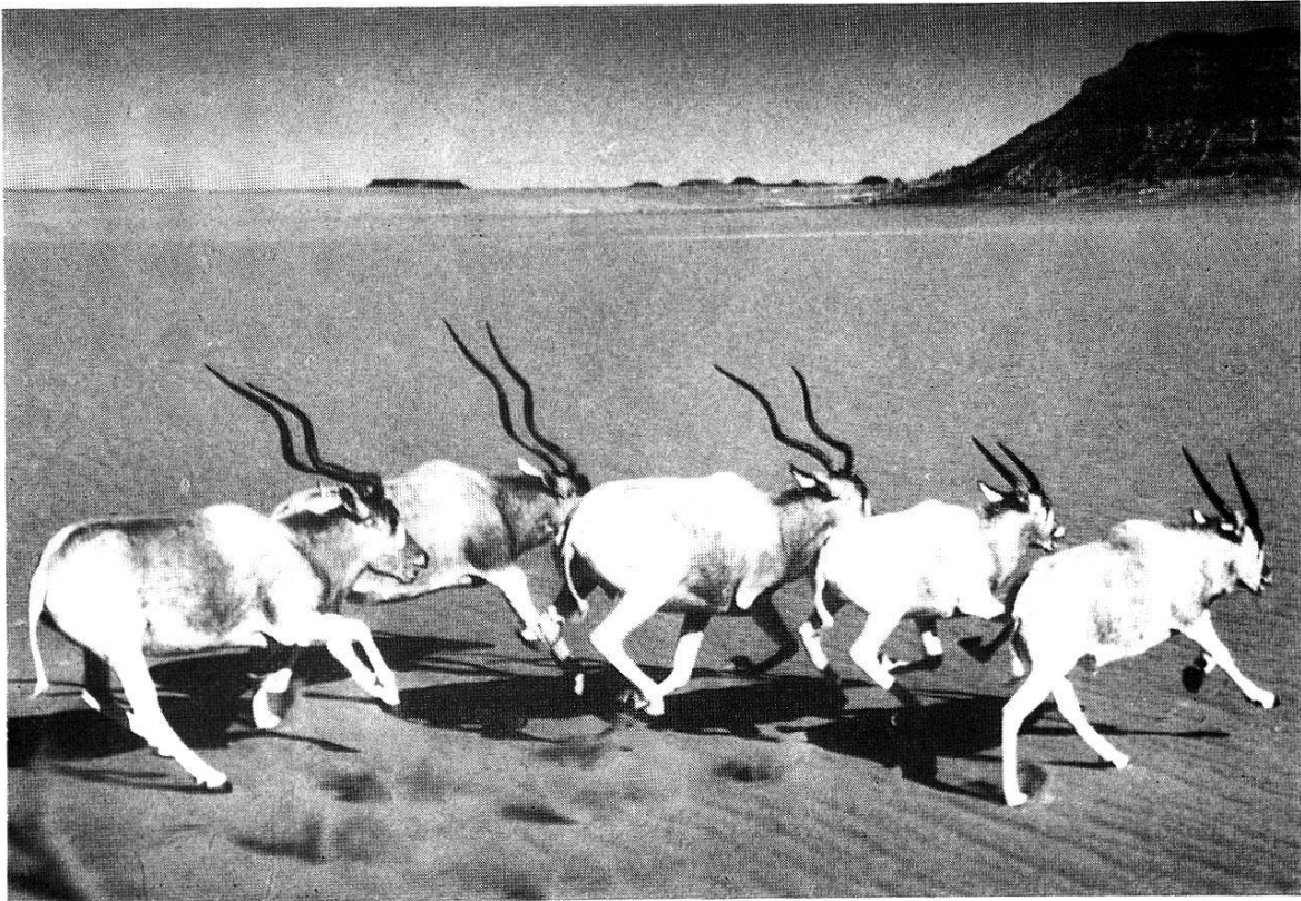
Fig. 1. Addax in the Chad, one of the most endangered antelopes of the Sahelian Zone.

scapes and the interesting endemic flora and fauna, the country has received much assistance in the field of conservation from the WWF and various other organisations.