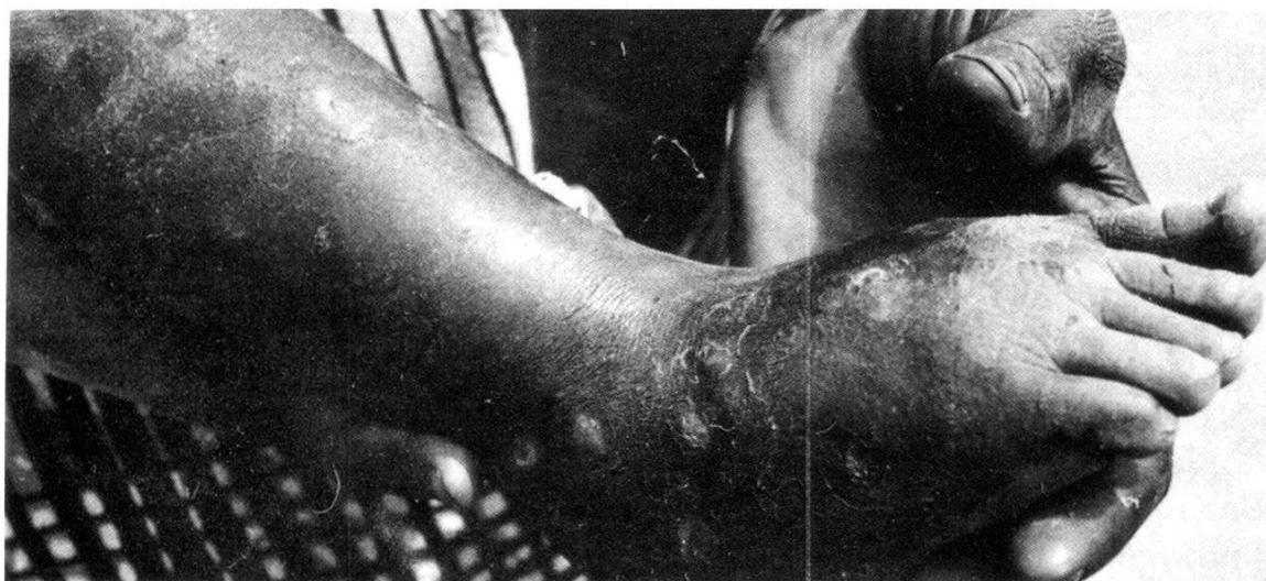
Fig. 1. Multiple infestation of the leg and foot of a 2-year-old boy by maggots of Cordylobia anthropophaga .

struction of houses, the deplorable environmental conditions, lack of disposal facilities and the unsanitary practises worsened by ignorance, collectively encourage the nuisance of flies, rats and strayed animals in the human neighbourhood. All these provide favourable conditions for the oviposition of tumbu-flies and for the invasion of human skin by their larvae following their emergency from the eggs. Of the 72 dogs examined, 50 (69.4%) had dermal myiasis. The observations made in different homes and at the sheep and goat selling markets showed that nasal myiasis due to the sheep botfly was rampant. Likewise, the findings at the city abattoir revealed that many of the cattle whose skins were examined, had multiple cattle grubs with extensive destruction of their hides and the underlying carcass meat which were discoloured and sometimes rendered undesirable for consumption.