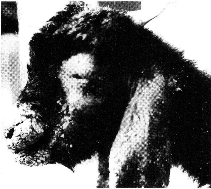
Fig. 1. A field case of severe sarcoptic mange in a goat showing thick fissured scab on the lips, muzzle, bridge of nose, round the eyes, on the cheeks and ears.

an extensive study on the genus Sarcoptes scabiei and concluded that it contains only 1 valid but variable species.