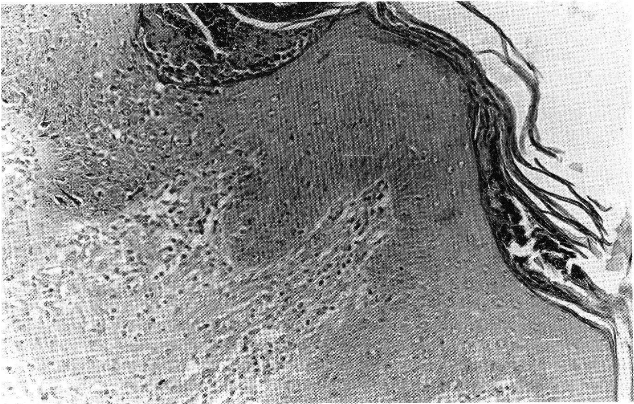
Fig. 4. Section of skin from donkey No. 3 infected with a goat strain of S. scabiei , showing hyperkeratosis, acanthosis, scab formation and infiltration with inflammatory cells. H & E. \times 100 .

By weeks 5 to 10 there was marked hyperkeratosis, and scab formation (Fig. 4). Shreds of mites were seen beneath the scab and keratin. The scab was infiltrated with degenerate polymorphs. There were marked degenerative and necrotic changes in the epidermis. The blood capillaries were dilated and there was some haemorrhage in the upper dermis and proliferation of the dermal connective tissue. The papillary layer and dermis were infiltrated with eosinophils, macrophages, lymphocytes and a few neutrophils.