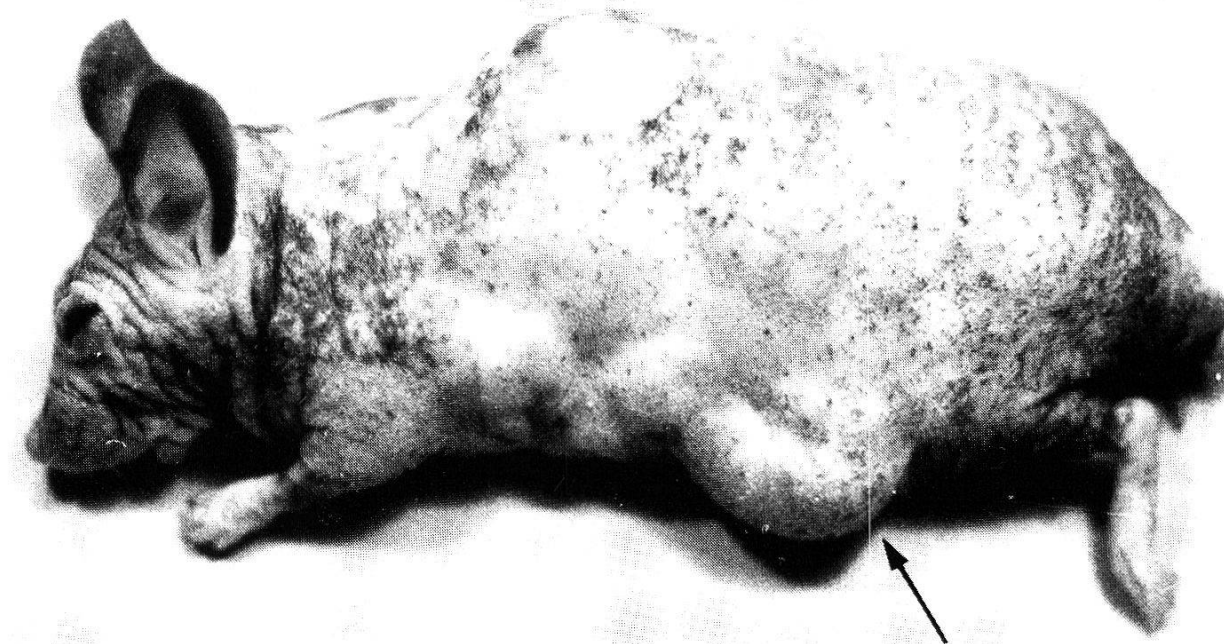
Fig. 4. Large varicosities (→) of a subcutaneous lymphatic harboring adult B. malayi from which lymph could repeatedly be aspirated, 274 days after subcutaneous inoculation with 50 L 3 .

circulating microfilariae and the syndrome was noted. As shown in Table 1, an overall 40.7% of microfilaremic and 17.1% of amicrofilaremic male mice exhibited filarial symptomatology. Conversely, 24% of microfilaremic and of 14.6% of amicrofilaremic males remained normal. Therefore, we agree with Rogers and Denham (1974), that living adult worms and not microfilariae appear to be the pathogenic stage.