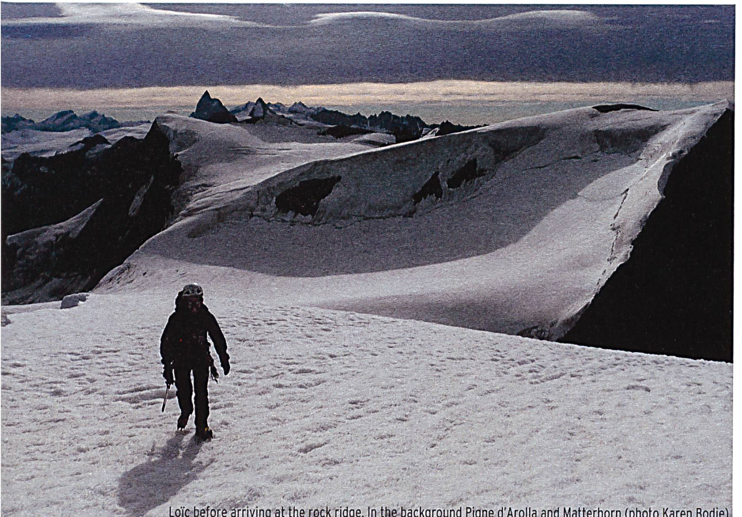
Loïc before arriving at the rock ridge. In the background Pigne d'Arolla and Matterhorn