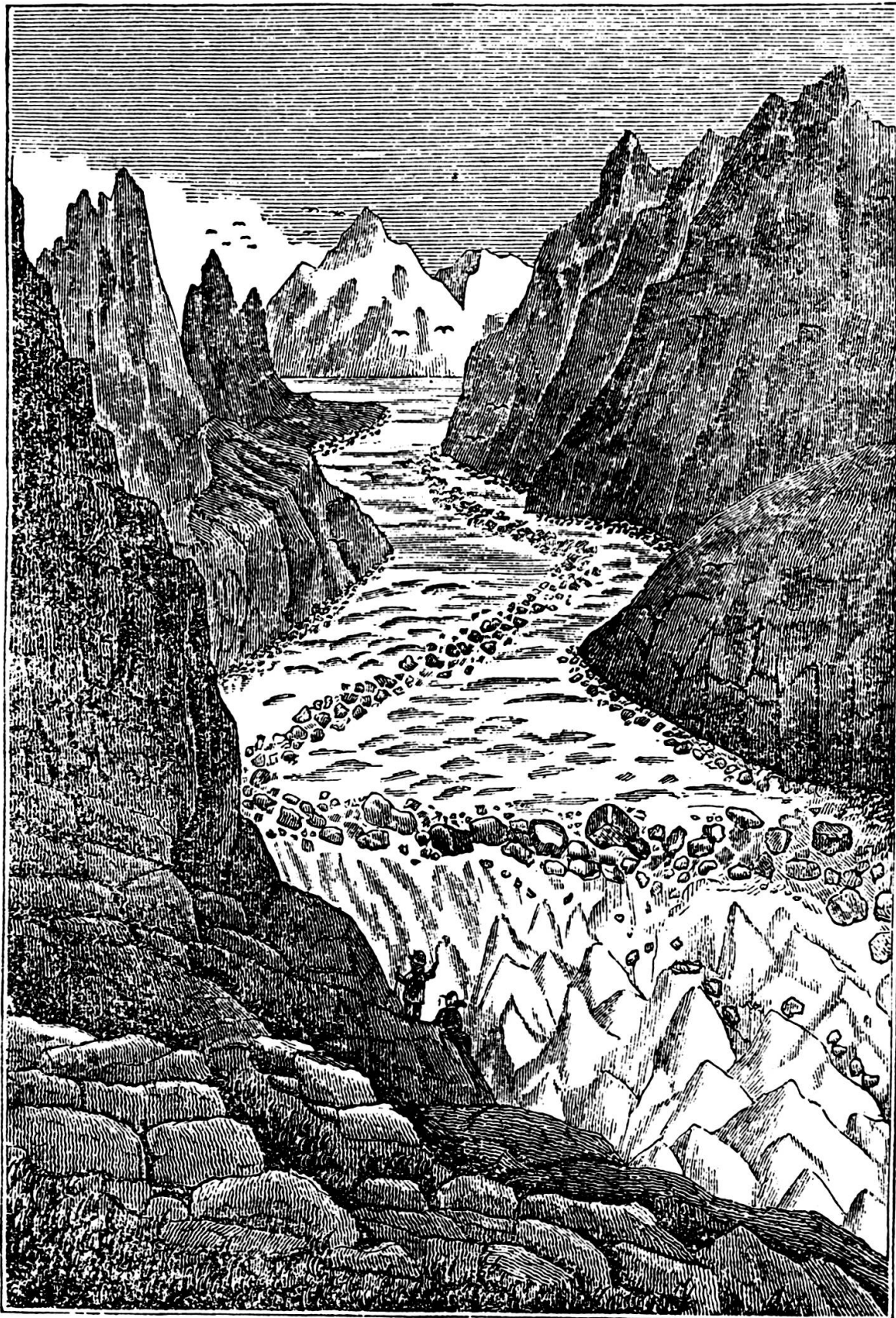
Glacier of Viesch in the Alps.

FIG. 1. — Reproduction of plate 10 of Agassiz's folio atlas of the Etudes sur les Glaciers (1840) in Hitchcock's Final Report on the Geology of Massachusetts (1841), Postscript, p. 6a, fig. 277.