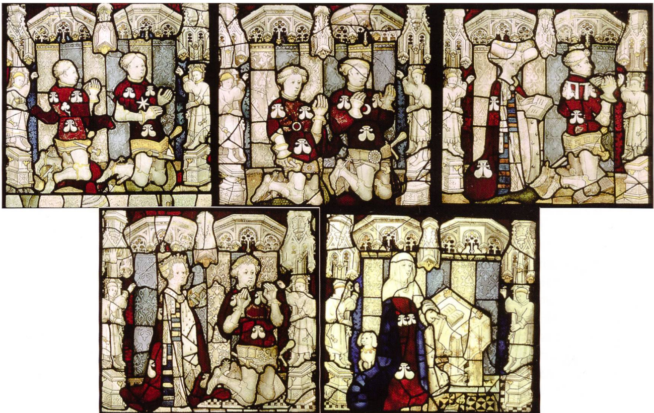
Roos family St William window

of friends and kinsfolk on a tomb would enable them to benefit from the prayers being said for the deceased. The benefit might also work in the opposite direction: placing the arms of revered saints and great heroes of the past in a church encouraged them to watch over it. Their spiritual presence in the building thus secured would facilitate their readiness to intercede in heaven for the church and for those who supported it.