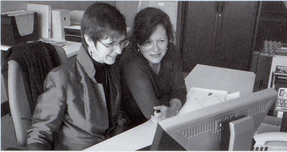
La bibliothécaire et l'archiviste compilent les informations.