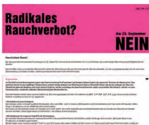
Websites for the vote on the "protection against passive smoking" initiative from the e-Helvetic collection

The conservation guidelines were completely redrafted. The new version replaces the guidelines dating from 1999. In addition to specific handling instructions and rules, the fundamental approach is crucial: the guidelines oblige all members of NL staff to treat documents with care. Preservation of the collection is not the task of the specialists alone, but also of every member of staff. During 2012, all employees who regularly come into contact with original documents therefore received training on how to deal with them.