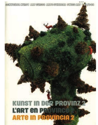
Schweizer Kunst, no. 1/2 (2009)

The NL staged two exhibitions in Bern: What Lenin Read. The Revolutionary in the National Library and the trilingual project Rilke and Russia . Both were well received by both visitors and the media.