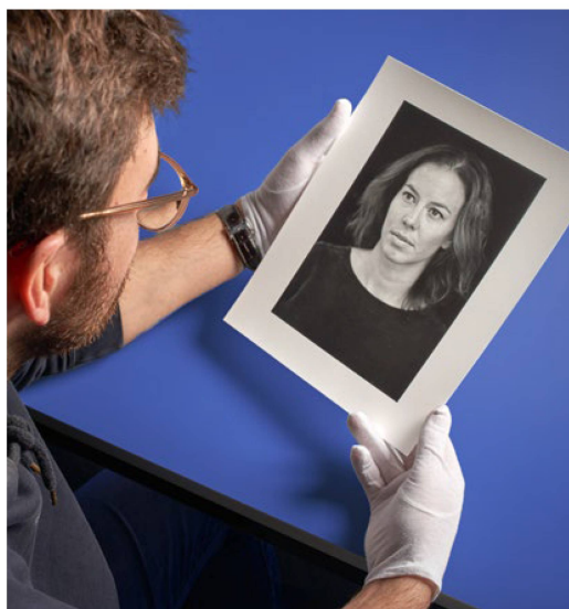
Christian Scholz (*1951) Portrait of Michelle Gisin, silver gelatine print, 2020