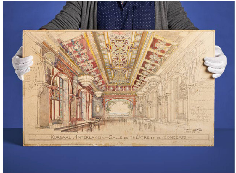
Paul Bouvier (1847–1940)

At 745, the number of information and research requests was slightly below the levels of previous years (2021: 775). The collection areas most in demand were monument preservation and photography. The number of visitors on site was higher than the previous year (116 versus 91 in 2021). Some 80 original documents were loaned for ten exhibitions. Particularly worthy of mention are the loans of historical photo documents for the travelling exhibition on the beginnings of photography in Switzerland ( Dal Vero at the MASI Lugano, D'après nature at the Photo Elysée Lausanne), the loan of works by minor masters to the Kornhausforum Bern, and the loan of the Mey-