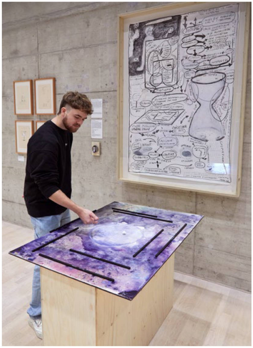
Friedrich Dürrenmatt – Le Jeu Temporary exhibition