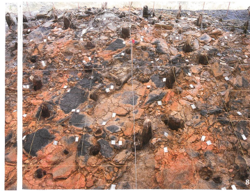
Fig. 8 Anarghiri III (Late Neolithic I) Destruction layer of the upper floor of a two-storey pile dwelling.

After the settlements mentioned had been abandoned two new lakeside settlements were built