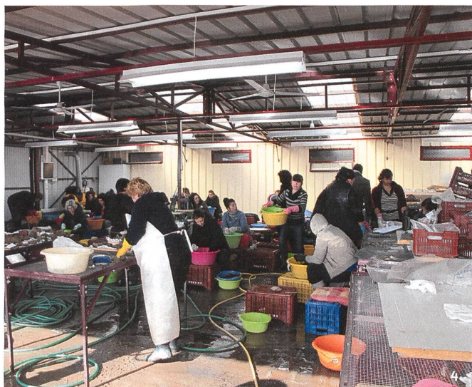
Fig. 4 Aghios Panteleimon. Cleaning of archaeological material. Fundreinigung. Lavage du matériel archéologique. Lavaggio dei reperti archeologici.