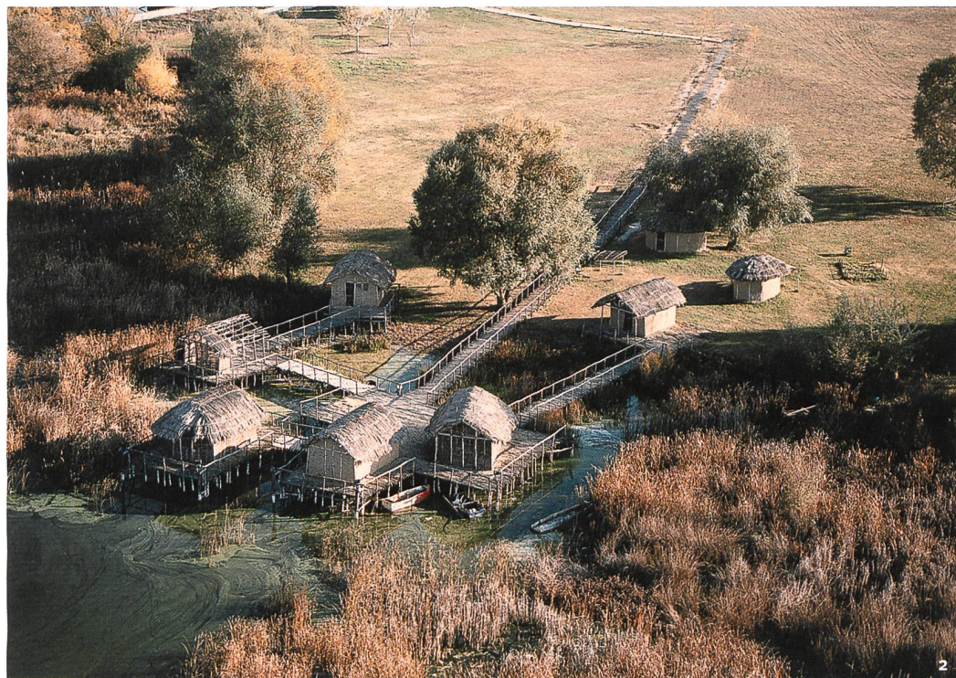
Foto aerea del Dispilio Pile Dwellings Eco-Museum.

Vue aérienne du Dispilio Pile Dwellings Eco-Museum.