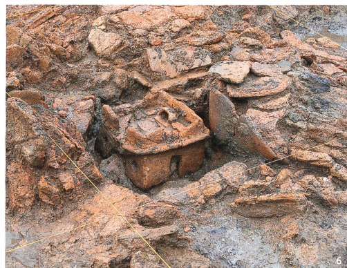
Fig. 6 Limnochori II (Late Neolithic I) Clay house model from the destruction layer representing a two-storey pile dwelling.

Das Modell eines Lehmhauses aus der Zerstörungsschicht zeigt ein zweistöckiges Pfahlbauhaus.