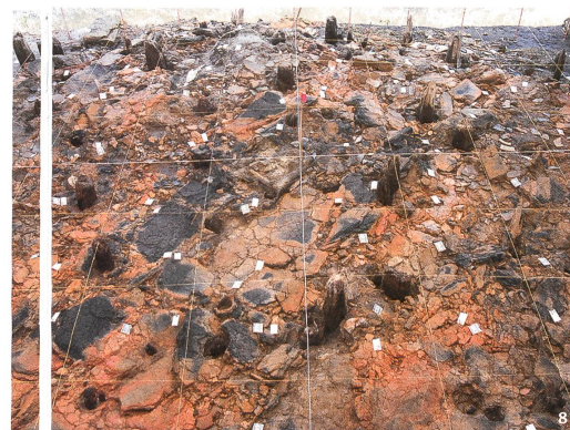
Fig. 8 Anarghiri III (Late Neolithic I) Destruction layer of the upper floor of a two-storey pile dwelling.

Zerstörungsschicht des oberen Stocks eines zweistöckigen Pfahlbaus.