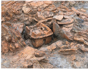
Fig. 6 Limnochori II (Late Neolithic I) Clay house model from the destruction layer representing a two-storey pile dwelling.

Das Modell eines Lehmhauses aus der Zerstörungsschicht zeigt ein zweistöckiges Pfahlbauhaus.