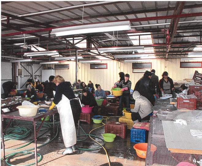
Fig. 4 Aghios Panteleimon. Cleaning of archaeological material. Fundreinigung. Lavage du matériel archéologique. Lavaggio dei reperti archeologici.