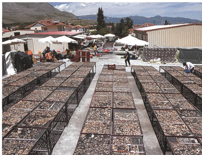
Fig. 5 Aghios Panteleimon. Drying and sorting of archaeological material. Trocknen und Sortieren von Funden. Séchage et tri du matériel archéologique. Asciugatura e classificazione dei materiali.

hundreds of graves organised in 18 tombs. This unique necropolis in the Balkans with its great variety of grave types, special burial customs and numerous high-quality grave goods was used for at least 500 years up to the first half of the 6 th century BC.