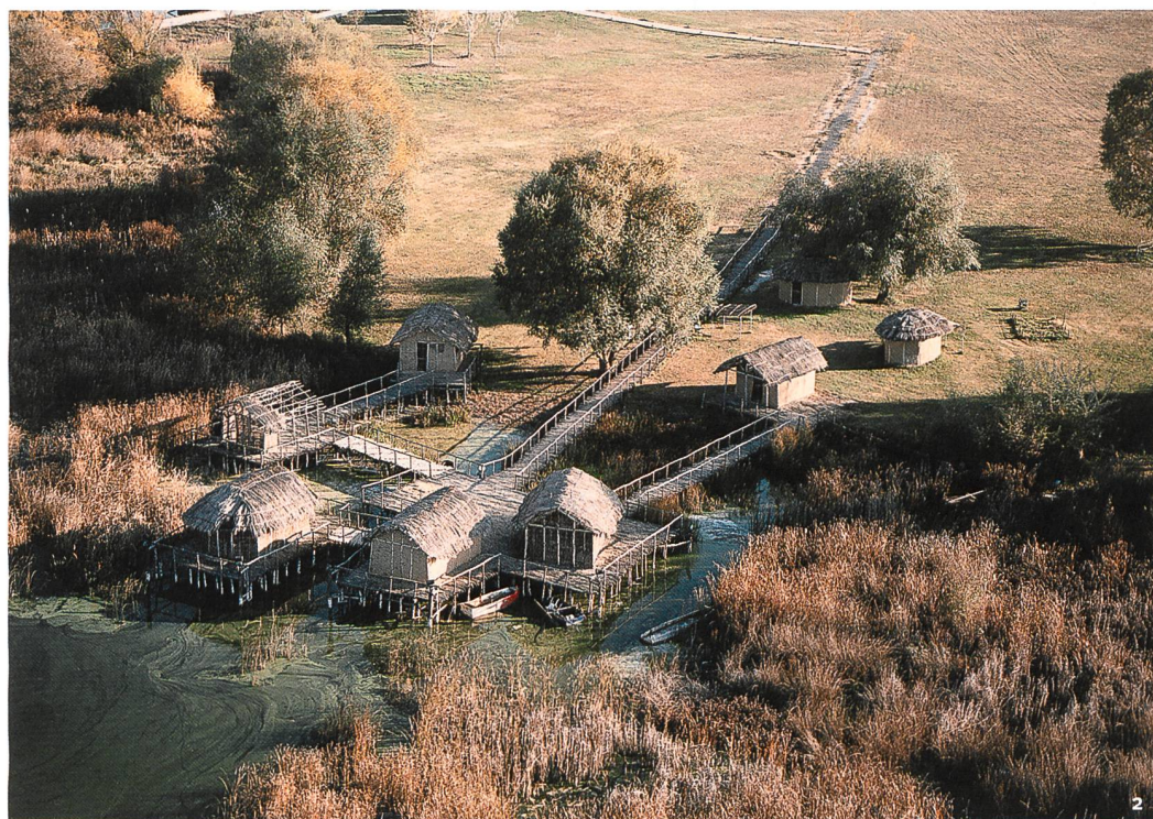
Foto aerea del Dispilio Pile Dwellings Eco-Museum.

Vue aérienne du Dispilio Pile Dwellings Eco-Museum.