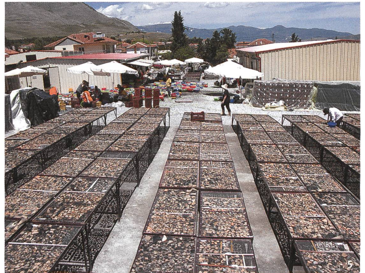
Fig. 5 Aghios Panteleimon. Drying and sorting of archaeological material. Trocknen und Sortieren von Funden. Séchage et tri du matériel archéologique. Asciugatura e classificazione dei materiali.

hundreds of graves organised in 18 tombs. This unique necropolis in the Balkans with its great variety of grave types, special burial customs and numerous high-quality grave goods was used for at least 500 years up to the first half of the 6 th century BC.