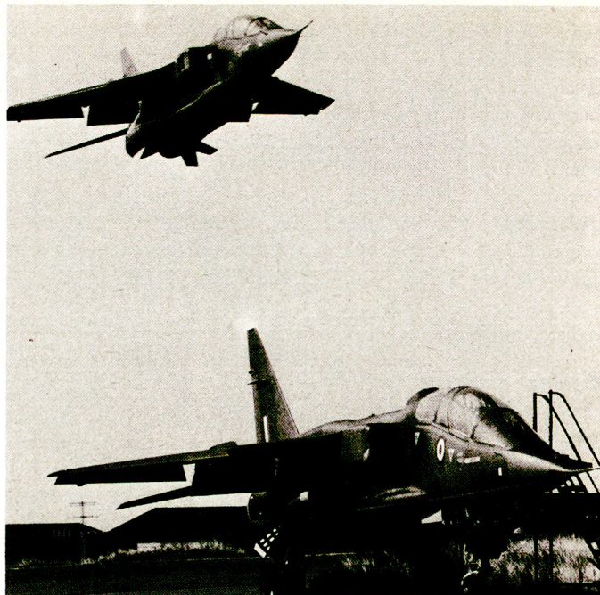
Illustration 1. The BAC-Breguet Anglo French "Jaguar" will have a tactical nuclear capability. It is now entering service with the RAF and French Air Force.

M. Michel Debré has made this very clear. He said in 1972 that "defence has to be national if it is to be credible" and added that as far as Anglo-French nuclear co-operation was concerned