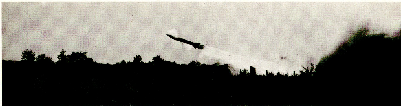
Illustration 4. An "Honest John" rocket. The Army is to be re-equipped with the longer ranged US "Lance".