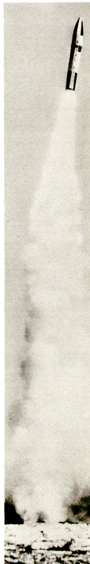
Illustration 5. HMS "Resolution" has just fired a "Polaris" missile while submerged.

Certainly there is room for Anglo-French economic co-operation in the nuclear field especially in the 1980s when the replacement for the "Polaris" missile becomes essential. Or it may come a great deal sooner should the post Vietnam/Watergate period in the United States produce a total revulsion against overseas commitments. In this event the Anglo/French nuclear force would not be just small pawns in the Great Power Stakes but could become a vital deterrent force against an attack by the Soviet Union and her Warsaw Pact Allies designed only to subjugate Central Europe. Unlikely? Yes, but nothing is impossible in this uncertain world.