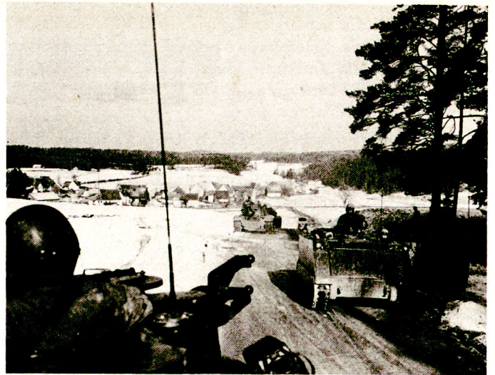
'Soldiers must have initiative, be well trained and well motivated' US troops on exercises in the winter.

The measures designed to build such an Army are divided into two related but distinct categories; the first and most important is declared to be "Strengthening Professionalism - to build positive incentives to serve". This, the Chief of Staff is convinced, is the real attraction of soldiering and the source of motivation and pride which will sustain efficient soldiering. The second category is measures to "Improve Army Life - to reduce the sources of dissatisfaction!" This means trying to remove the irritants and aggravations which are deterrents to service and detract from the environment in which the military man and his family live.