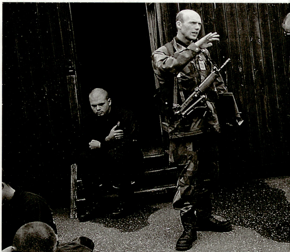
Exercise «DALECARLIA»: The Dalecarlian POW camp-commander under dis

The idea of training members (a chamber) of the Commission – as part of the willingness to check its capability and to keep up the preparedness – was proposed by Sweden in 1997. After a positive answer it was decided