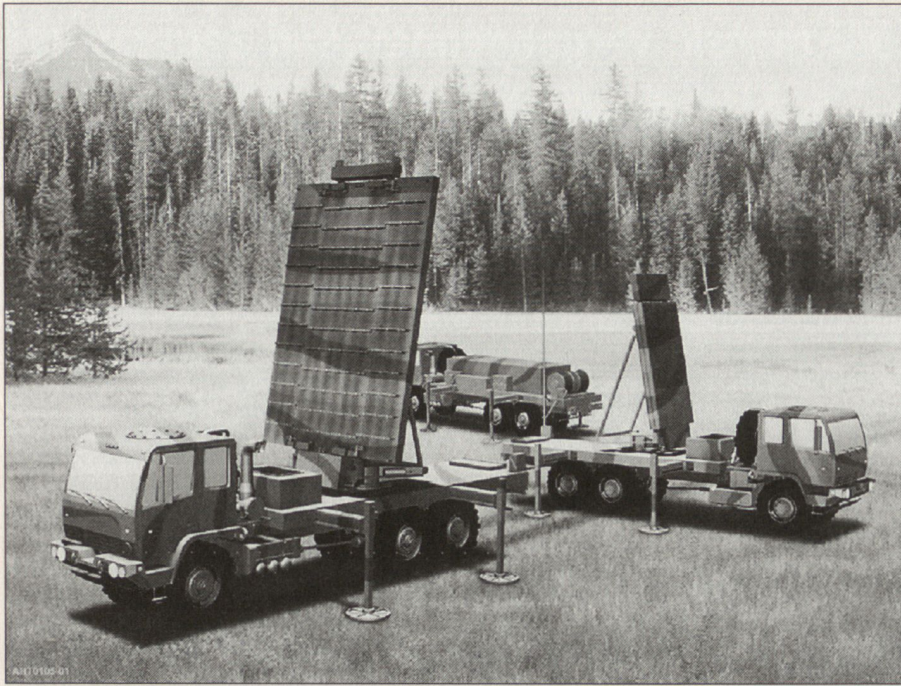
A standard MEADS fire unit incorporates two X-band MFCRs and one UHF Surveillance Radar.

The networked and distributed architecture being adopted for MEADS is fundamentally different from that of its predecessors. A "plug and fight" capability allows individual elements to be inserted as missions and threat dictate. MEADS major end items, Tactical Operations Centers (TOCs), radars, and/or launchers can be added or deleted to optimize the defense with minimal equipment and force structure. MEADS' plug-and-fight capability and comprehensive interoperability requirement will provide MEADS with the capability to command and control all the allied air defenses supporting an operation or theater.