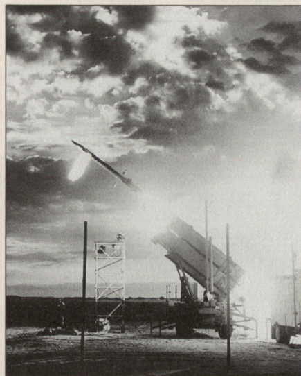
MEADS incorporates the proven hit-to-kill PAC-3 missile, now in production.

the state-of-the-art technology for countering tactical ballistic missiles and is armed with a lethality-enhancing warhead for use against air-breathing targets. The missile combines standard aerodynamic control surfaces and multiple single-shot thrusters to achieve the very agile high-g maneuvers required for precise hit-to-kill. In the terminal phase of flight, the missile acquires and tracks the target with its forward-looking gimbaled active RF seeker and is extremely difficult to jam, even with advanced cooperative mode jamming.