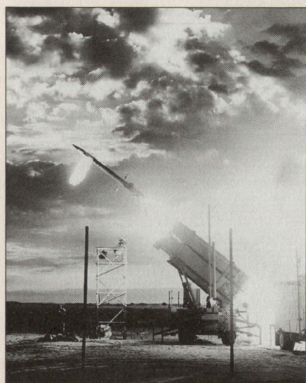
MEADS incorporates the proven hit-to-kill PAC-3 missile, now in production.

Additionally, MEADS' lower cost of operations is critical to accommodate a reduced force structure and operating budgets. Enhanced reliability, reduced maintenance costs, and significantly reduced manning requirements are critical design criteria that distinguish this U.S.-European co-developed air defense system.