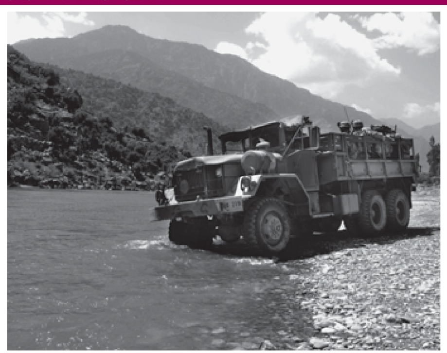
A short time after 9/11 the United States sent military forces into Afghanistan to fight at one source of terrorism. Here members of C Company, 1st/32 Battalion, 10th Mountain Division are crossing the Pech River during a mission in Afghanistan.