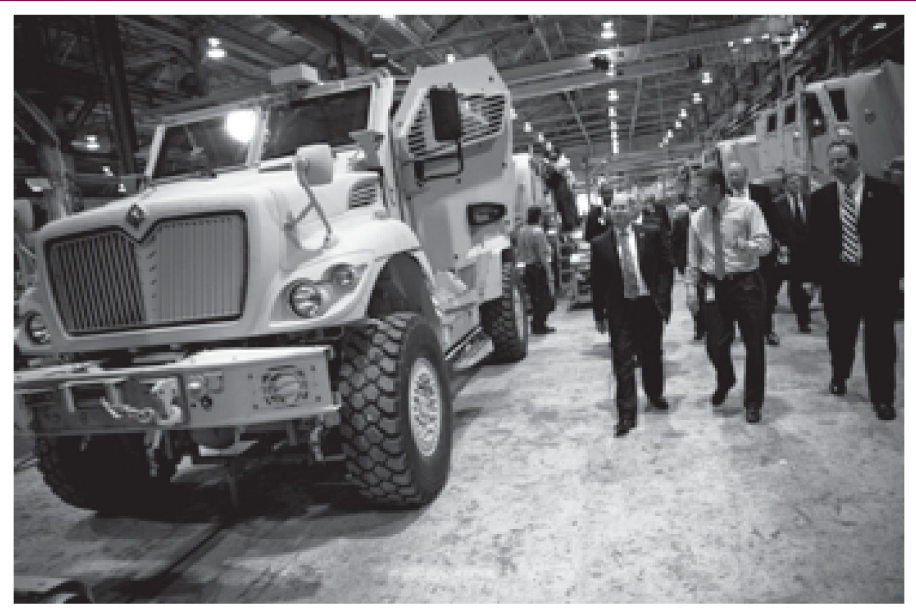
The US armed forces often suffer heavy casualties from mine blasts in Iraq. To reduce the risks during life threatening patrols, the Army is now deploying the new vehicle MRAP which offers much better protection to the crew.

ing that China increasingly comes to share Western values embodied in the Enlightenment, certainly for the foreseeable future China is not close to seeking, accepting or receiving the mantle of global leadership on security matters. Its pretensions to global military power remain mostly external interpretations of where China may be heading in the future rather than any declared aspiration on the part of the Chinese Communist Party. China's meteoric rise since Deng Xiaoping opened up China in 1978 has produced impressive economic growth, but progress has also exposed a host of domestic threats from environmental, social, and political causes.