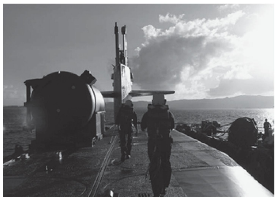
Four former strategic ballistic missile submarines of the Ohio-class were recently converted to cruise-missile and Special Operation Forces carriers. They each have 154 Tomahawk cruise missiles aboard and thus offer a unique strike power to the operational U.S. commanders worldwide.

As all of this underscores that the United States remains unique in its military prowess. Although the world is more multipolar, or perhaps nonpolar, than it is unipolar, there is still no alternative to the U.S. as the world's leading enforcer or policeman. But