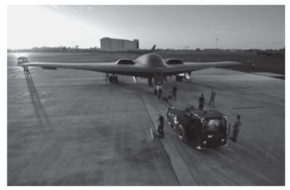
Strategic bombers such as this B-2 from 509th Bomb Wing are important instruments for the political-military leadership of the United States of America. This stealth aircraft is refuelling at Hickham AFB, Hawaii, on its way to Guam.

in international security under Chancellor Merkel to include support for peacekeeping in Africa. While a common security and defense policy, spearheaded by a rapid reaction force, remains problematic