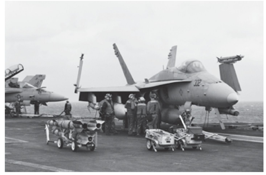
Aircraft carriers are important assets in the United State's global security role. This F/A-18 C of Strike Fighter Squadron 37 belongs to the carrier USS Harry S. Truman currently conducting maritime security operations in the Persian Gulf.