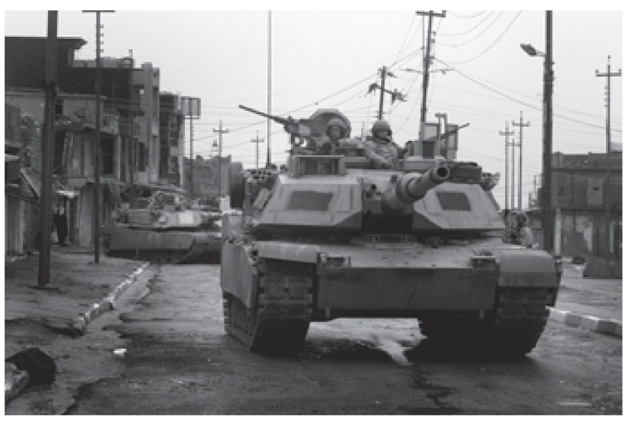
A M1-A1 Abrams tank of the 3rd Armoured Cavalry Regiment moves through the streets of Mosul, Iraq. As part of their global commitment, the United States invaded the country in 2003 to free its population from Saddam Husseins regime.

In the long run, many see China's reemergence as a global power as offering an alternative to diminishing American clout. Even if such a linear transition between great powers were to take place, and assum-