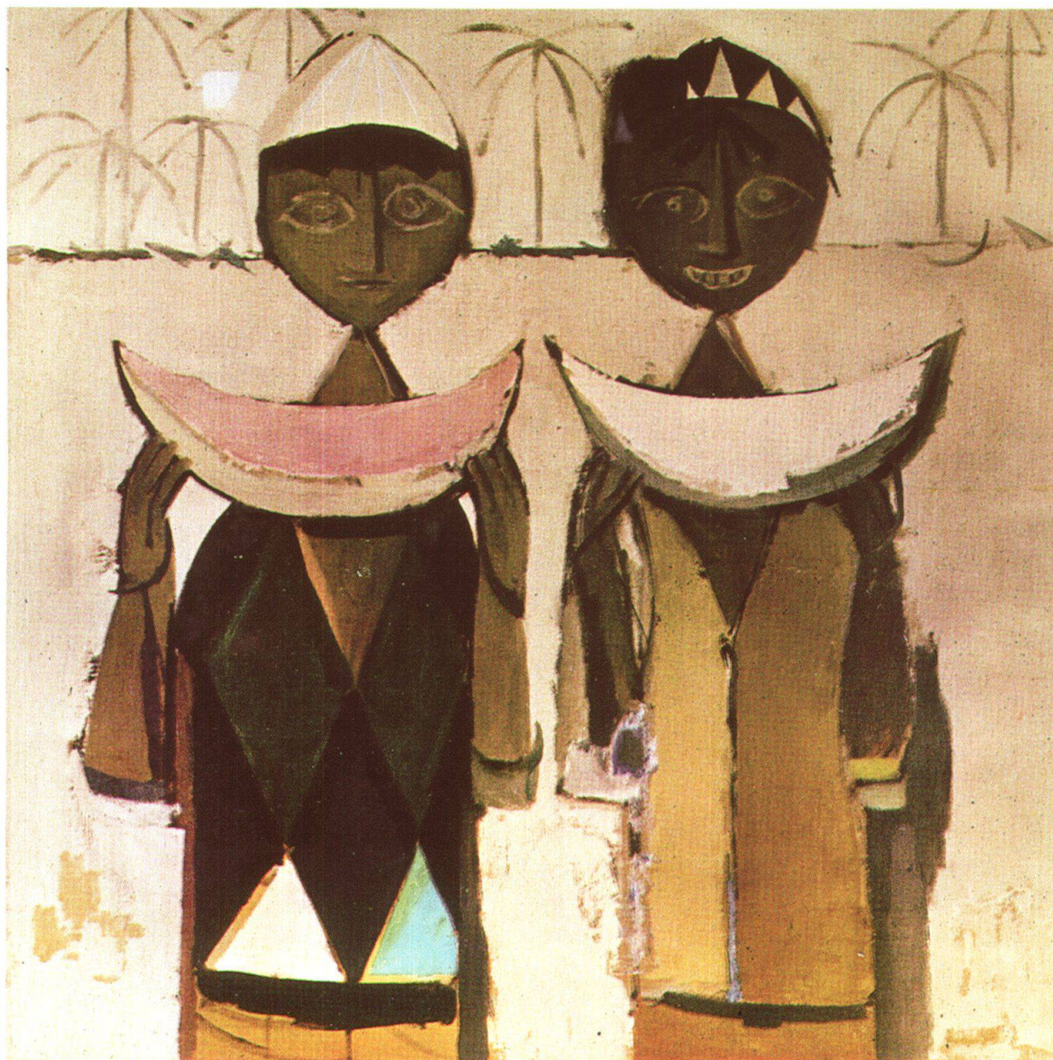
Fig. 2: Jawād Salīm (Iraqi, 1919–1961), Water melon eating children , 1950ies.