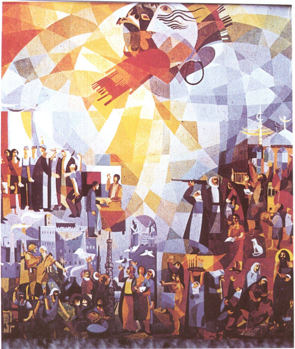
Fig. 6: Nizār al-Hindawī (Iraqi, 1947– ), Nationalization , 1974.