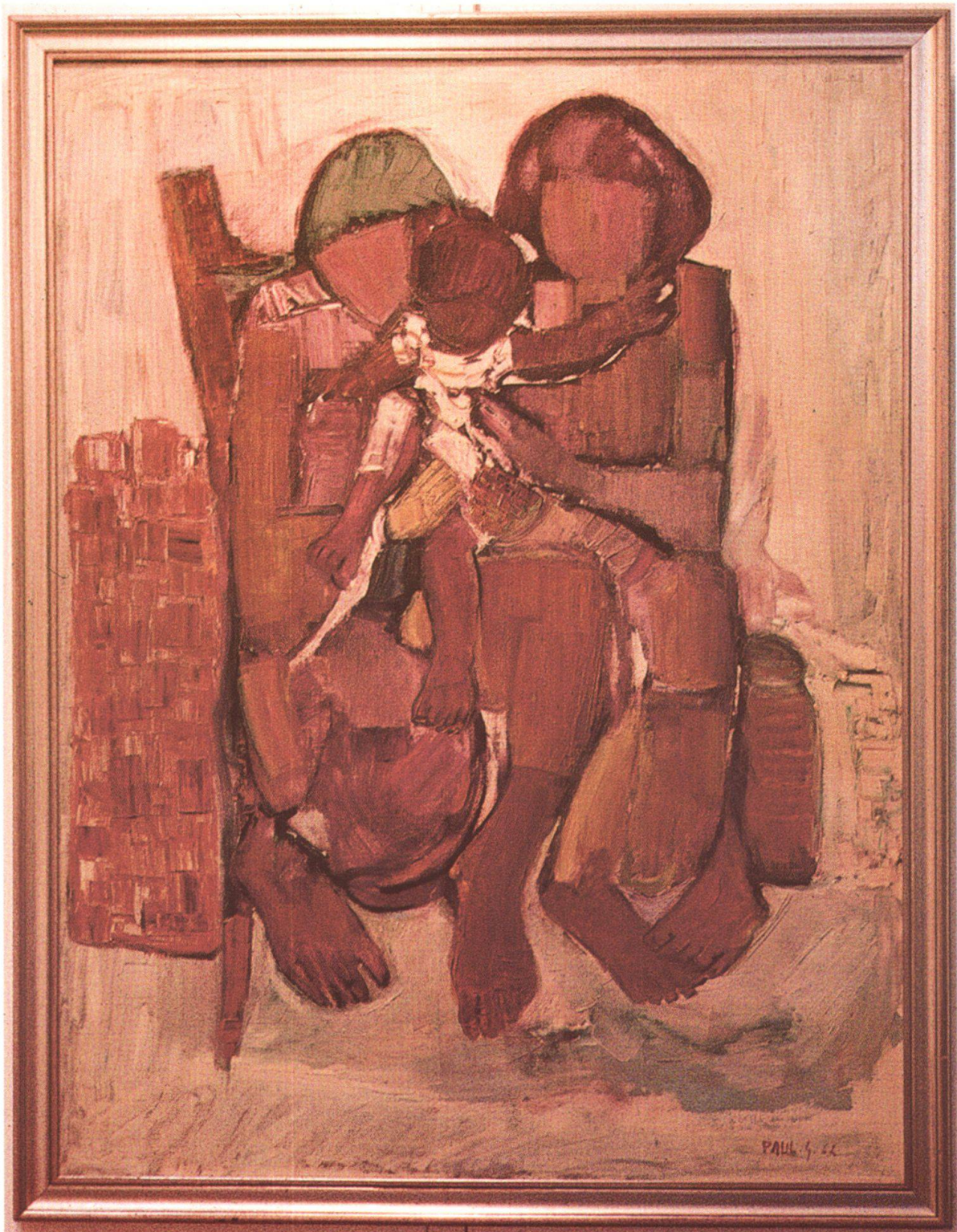
Fig. 4: Paul Guiragossian (Lebanese, 1926–1993), The Family , 1962.