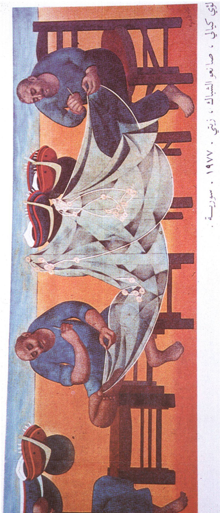
Fig. 8: Lu'ayy Kayyālī (Syrian, 1934–1978), Fishermen , 1977.