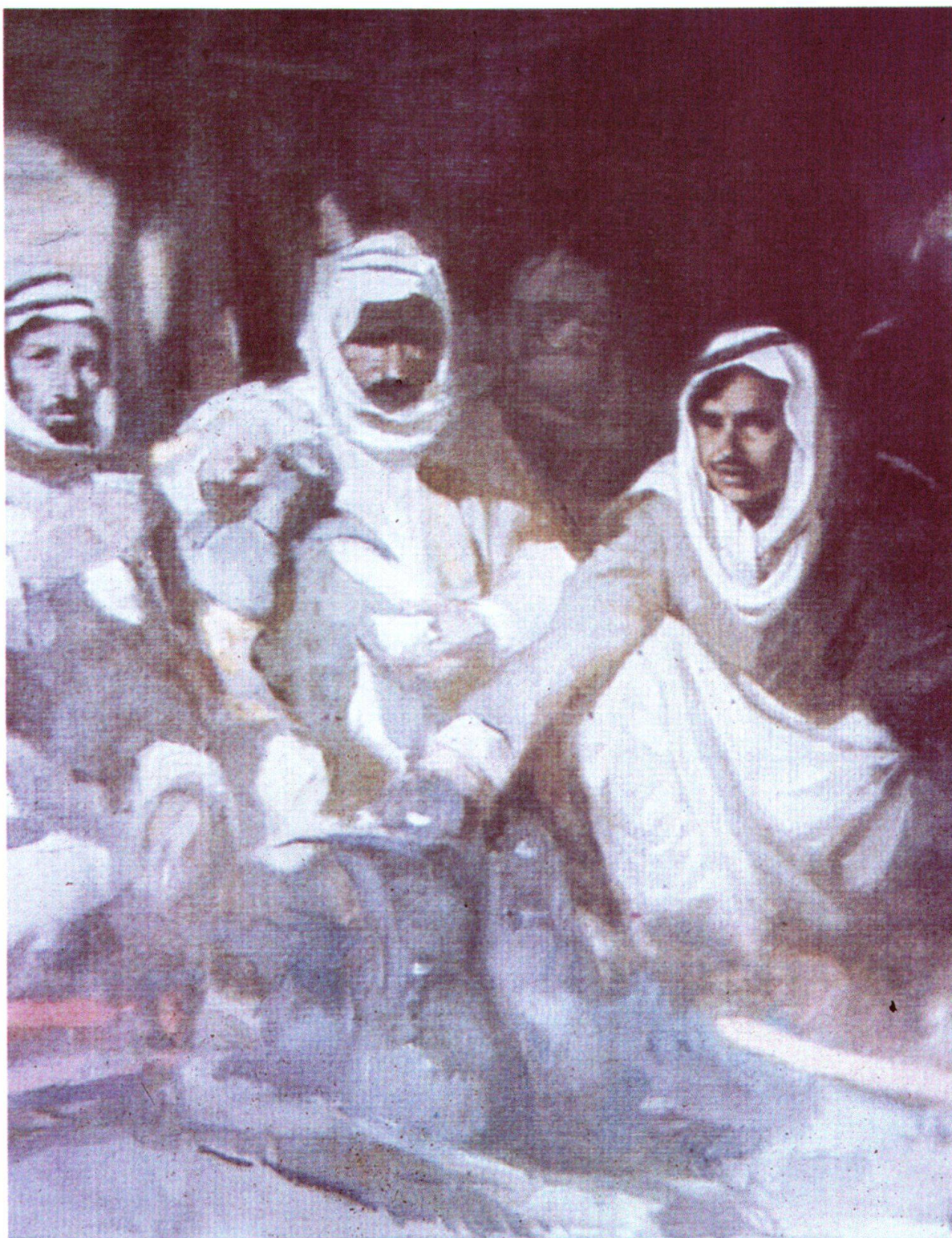
Fig. 7: Fāḥ Hasan (Iraqi, 1914–1992), The Maḍyaf , 1975.