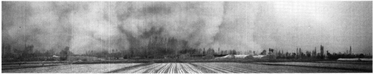
Plate 4: Sandstorm (Hisun Wong).

He wants to find three different aspects: a pure landscape without any human trace, quietness, and the idea of a scene that has not been changed for many centuries. His photos perform the past and they perform subjective narratives of the past. How is it possible to “reconstruct” the past? Hisun Wong sends his colour negatives to France and his black and white negatives to the USA for printing and to have them developed. In France, Fresson Print still uses methods of 1950 to make his colour photos look older, and American procedures guarantee that the black and white photos look as if they were taken in the 40’s or 50’s. 12 In both cases it is imagination not experience that guides the photographer to make Dunhuang look more Dunhuang, because Hisun Wong is too young to have lived in any of his favoured past ages.