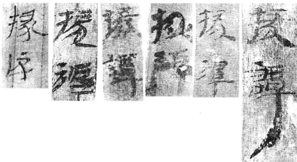
Illustration 6 (from left to right): EPF22.247B, .250B, .301B, .334B, .430B, and .460B.

5. The second kind of evidence for the assumption that it was not the bureau heads who actually copied and personally signed manuscripts is the fact that there are a number of documents in various different hands that show the same individual – a bureau head Tán 譚 – named at the end. This is the case on the verso side of strips EPF22.45, 48, 247, 250, 254, 301, 334, 379, 413, 430, 460, 508, 532, etc.. The dates on these manuscripts, as far as they have been preserved, range from AD 23 to 31. The place of origin of all the manuscripts is the company of Jiǎqú 甲渠 (or Jiǎgōu 甲溝 under Wáng Mǎng). Therefore, it may be reasonable to assume that all these “Bureau head Tán” instances represent the same individual. 51 Yet, several different hands can be discerned (see ill. 6). 52