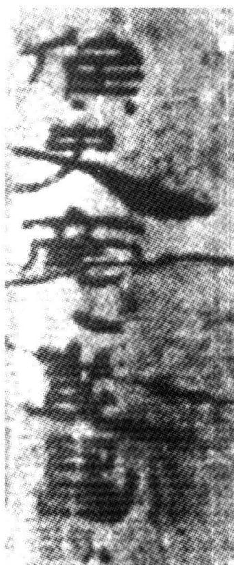
Illustration 4: A33-20.12 B.

3. In some cases, the same or nearly the same string of titles and names can be identified on different manuscripts. The lists of subordinate officials at the end of strips EPF22.68, 71A, 153B, and 462B, for instance, share the same bureau head ( yuàn 掾) Yáng 陽 and mostly the same probationary associate ( shǒushǔ 守屬) Gōng 恭, but have different writing assistants ( shūzuǒ 書佐), namely Kuàng 況, Fēng 豐, Bó 博, and Cān (or Sān) 參. Only strip 153B is slightly different insofar as it has “concurrent probationary associate Xí” ( jiān shǒushǔ Xí 兼守屬習) instead of the “probationary associate Gōng” (see ill. 5).