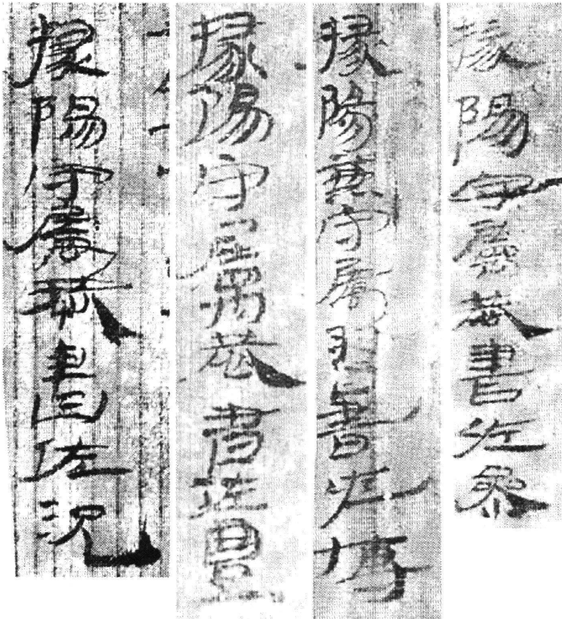
Illustration 5 (from left to right): EPF22.68, .71A, .153B, and .462B.