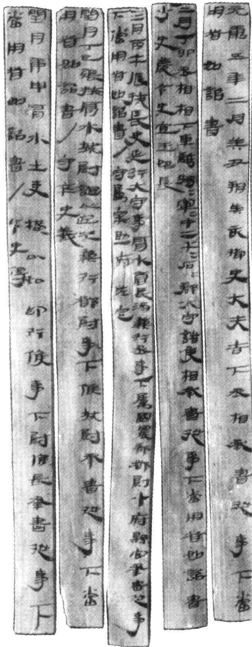
Illustration 2: A33-10.29 to 10.33.

weapons and other ritual stipulations during summer solstice of the year 61 BC (see ill. 2). 39