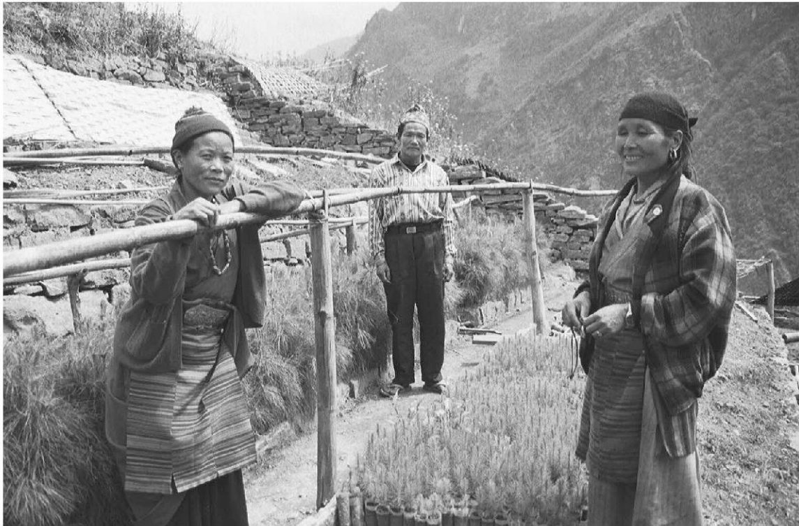
Photo 3: Women's group members and the caretaker in their tree nursery in Sekathum.

women. However, other villages with the same ethnic affiliation have women's groups that function well. This stresses the importance of support by the project staff in the process of forming women's groups.