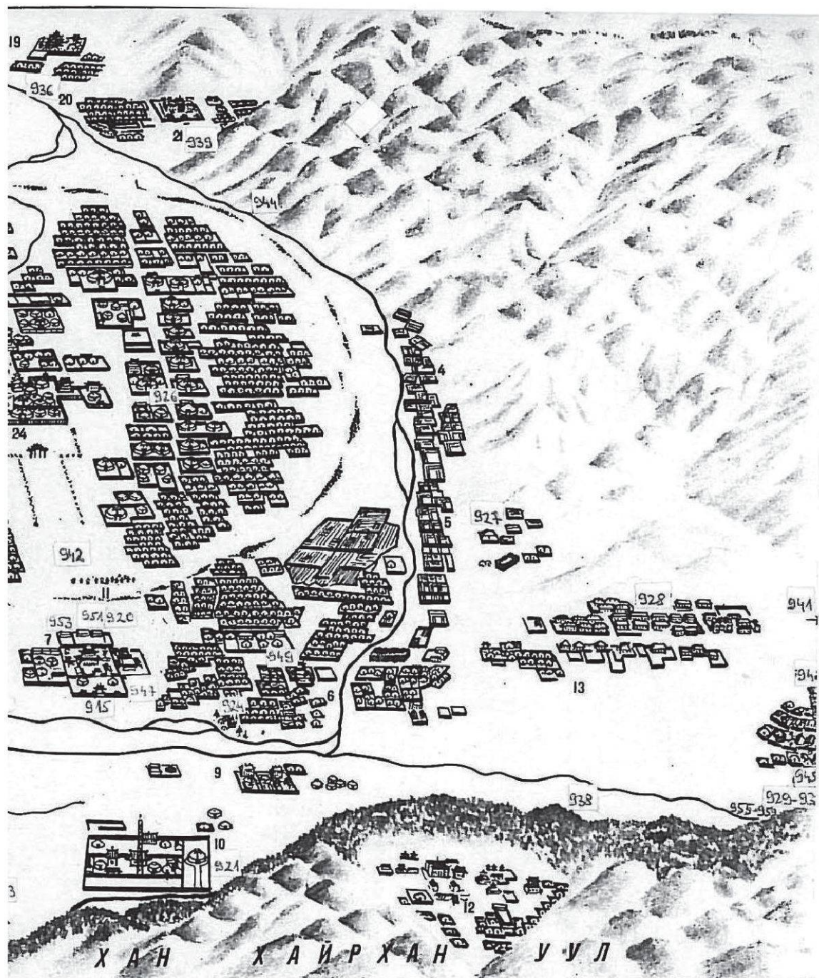
Figure 1b: Jügger's painting (right side), 1913 (Bogd xaan Palace Museum in Ulaanbaatar)