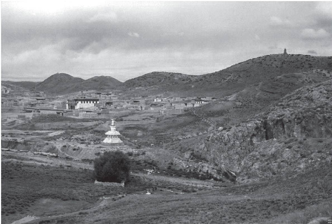
Plate 1: Tsezhig monastery.

The first monastery, which traces its foundation back to the legendary zhigpo and disciple of Zhugom Trulzhig at the same time, is Tsezhig monastery located in the locality called Gengya ( rGan gya ). Very little is known about the founder of the monastery. Recent sources, however, state that it was founded by Tsezhig Tongnyi Japhur ( rTse zhig stong nyid bya 'phur ) known also as Gomchen Yungdrung Gyaltsen ( sGom chen gyung drung rgyal mtshan , see RTSE ZHIG TSHANG SHES RAB BSTAN PA'I ZLA BA, 2006: 4–5; ANONYMOUS, 1993: 25–26; THAR, 2003: 272–277). He is mentioned as a disciple of Zhugom Trulzhig and founder of the monastery, which leads us to set both his life-time and the founding of the monastery in the 11 th or 12 th century.