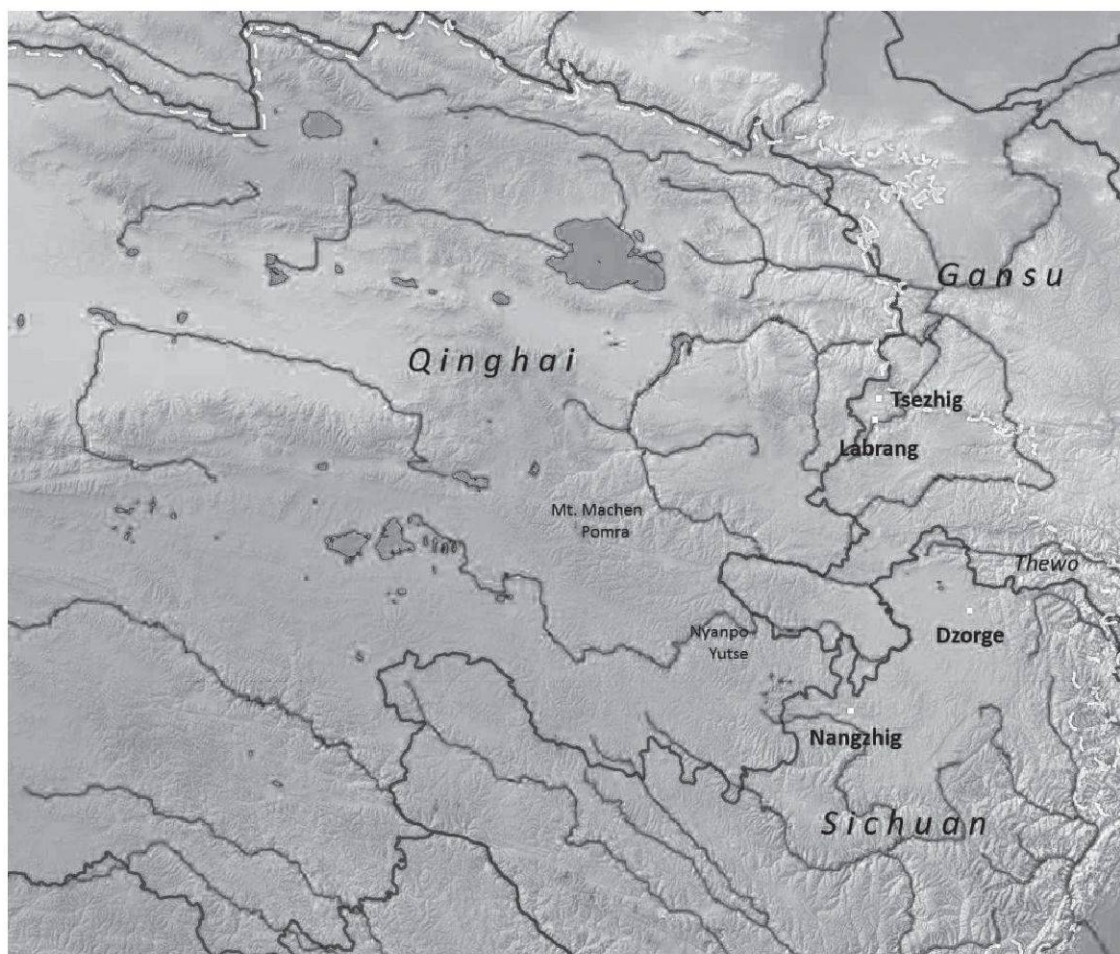
Plate 3: Map of the area.