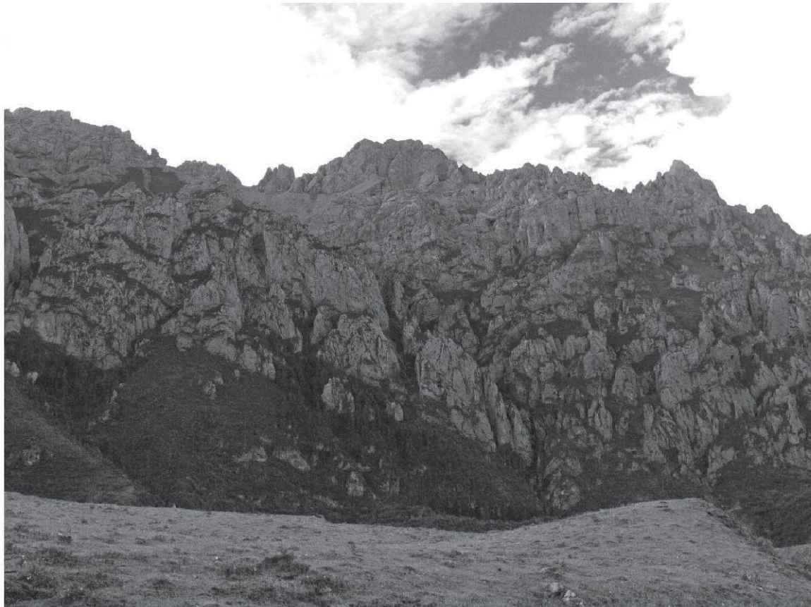
Plate 5: Dragkar Jagoe ( Brag dkar bya rgod).