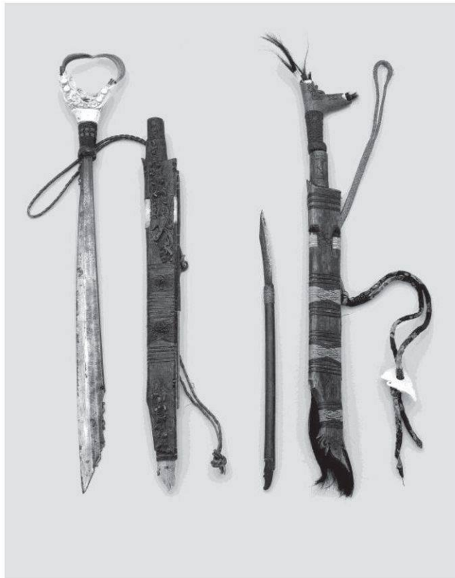
Illustration 4: Dayak swords, Leupold donation, Ethnographic Museum of the University of Zurich

wore.” 28 Bock also provides an instructive description of the effect this gift had on the local people he encountered: “The sight of my Mandau seemed to reassure her [the Dayak Rajah Dinda’s mother]. From the length of the hair tufts and the number of bead ornaments hanging from the sheath, she rightly judged that it belonged to the Sultan.” 29