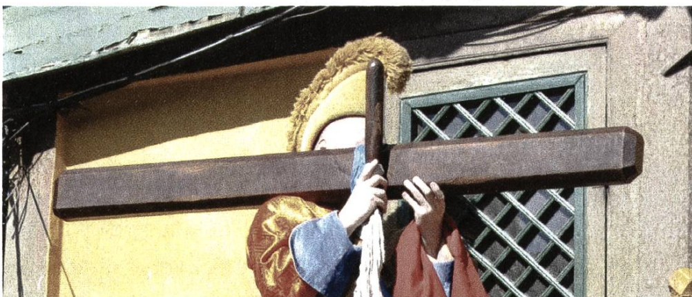
Figure 1: The gaṇḍī beam and gaṇḍī -striker used in the Gandantegchenlin monastery, Ulan Bator, June 2011.

Keywords: gaṇḍī beam, Tibetan Buddhism, Mongolian Buddhism, Material culture studies, poṣadha ritual