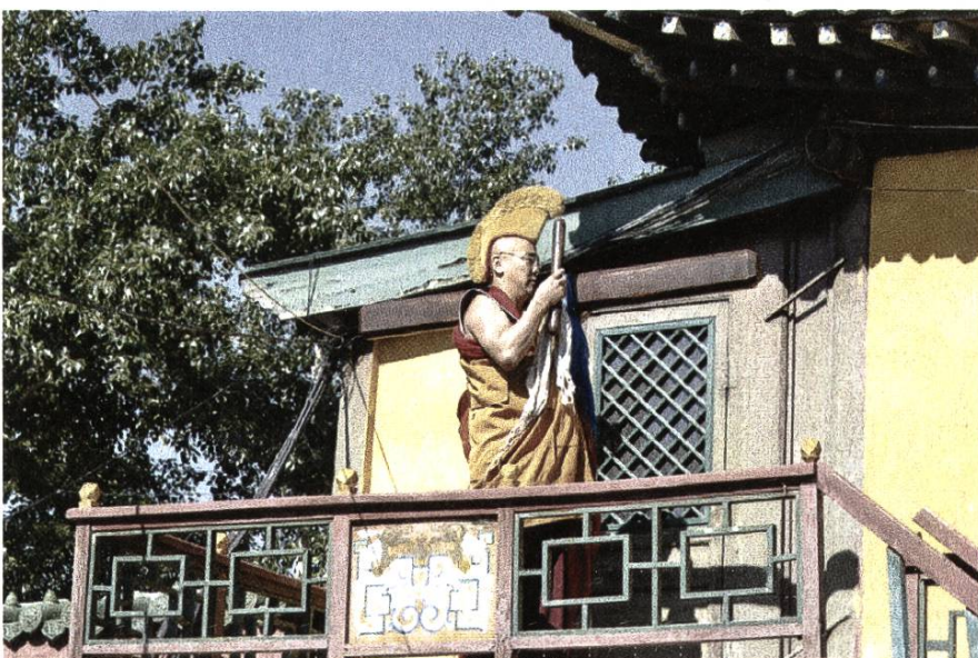
Figure 6: Gaṇḍī -striking ceremony performed on 30 June 2011 in the Gandantegchenlin monastery in Ulan Bator. A fully ordained monk is performing the gaṇḍī beam striking.