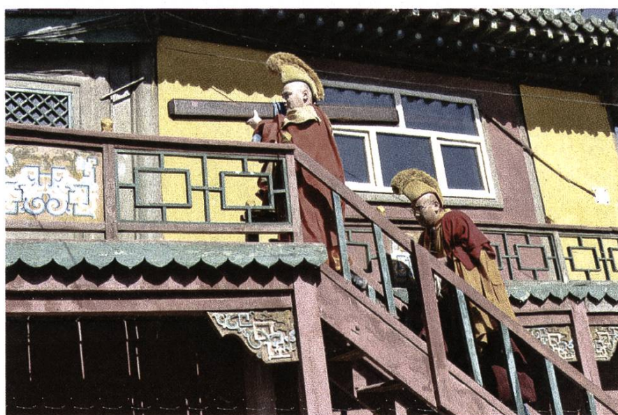
Figure 4: Gaṇḍī -striking ceremony performed on 30 June 2011 in the Gandantegchenlin monastery in Ulan Bator. The monks ascend to an elevated platform.

The ceremony is performed in four steps: a novice monk carries the beam called in Mongolian gandi or gandi mod (ModMong.) and a fully ordained monk carries a beam-striker, they ascend to an elevated place or raised platform (see Figure 4); the fully ordained monk who is to perform the striking makes