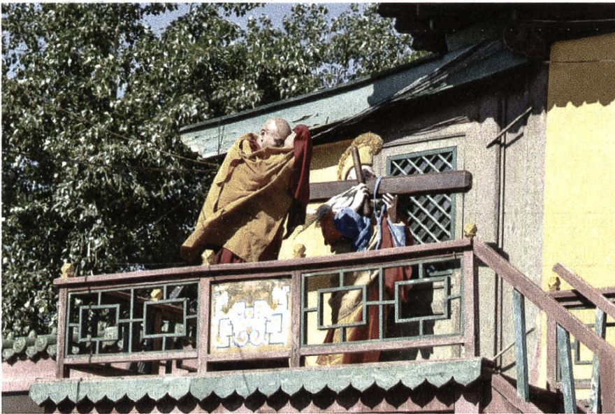
Figure 5: Gaṇḍī -striking ceremony performed on 30 June 2011 in the Gandantegchenlin monastery in Ulan Bator. A fully ordained monk is making three bows praising the Buddha.

At least in some monasteries, the tradition of the gaṇḍī -beam striking is maintained. The monks whom I interviewed in the course of field research conducted in summer 2011 in the monasteries of Gandantegchenlin , Dashchoilin , Betüv , Amarbayasgalant of Mongolia and the Ivolginskii dacan in Buryatia