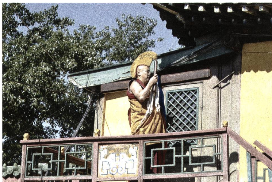
Figure 6: Gaṇḍī -striking ceremony performed on 30 June 2011 in the Gandantegchenlin monastery in Ulan Bator. A fully ordained monk is performing the gaṇḍī beam striking.