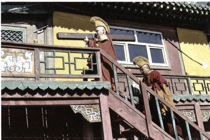
Figure 4: Gaṇḍī -striking ceremony performed on 30 June 2011 in the Gandantegchenlin monastery in Ulan Bator. The monks ascend to an elevated platform.

The ceremony is performed in four steps: a novice monk carries the beam called in Mongolian gandi or gandi mod (ModMong.) and a fully ordained monk carries a beam-striker, they ascend to an elevated place or raised platform (see Figure 4); the fully ordained monk who is to perform the striking makes