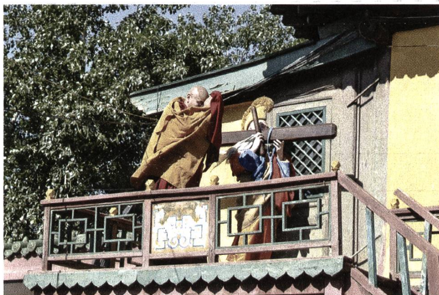
Figure 5: Gaṇḍī -striking ceremony performed on 30 June 2011 in the Gandantegchenlin monastery in Ulan Bator. A fully ordained monk is making three bows praising the Buddha.

At least in some monasteries, the tradition of the gaṇḍī -beam striking is maintained. The monks whom I interviewed in the course of field research conducted in summer 2011 in the monasteries of Gandantegchenlin , Dashchoilin , Betüv , Amarbayasgalant of Mongolia and the Ivolginskii dacan in Buryatia