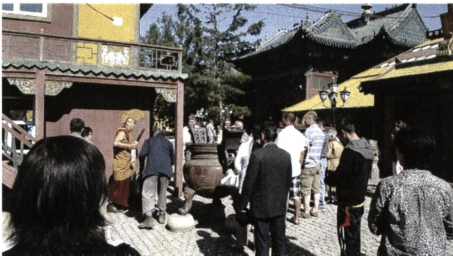
Figure 7: A monk blesses lay people with the gaṇḍī -striker. Gandantegchenlin monastery, Ulan Bator, June 2011.

The modern Mongolian tradition of the gaṇḍī treatment is first of all based on the attached, symbolical value of the artefact. The transcendent powers attributed to the beam, thanks to its incorporation into the complex system of Buddhist philosophy and mythology, are actively exploited by religious specialists, that is, the Buddhist clergy, and are also readily appreciated by the laity. Used exclusively for the performance of inner, monastic rituals such as the poṣadha , the gaṇḍī facilitated interaction between monkhood and lay followers on the social level, and between humans and divine entities on the transcendent level. To me, these functions of the object were most visible when I observed the final phase of the gaṇḍī striking, performed as an introductory part of the poṣadha in the Gandantegchenlin . While the monk performed the striking a group of lay devotees gathered below the platform on which he conducted the ceremony. After he finished and went down from the platform, the people rushed to him one by one to get the blessing which he granted by touching their bowed heads with the gaṇḍī -striker (see Figure 7).