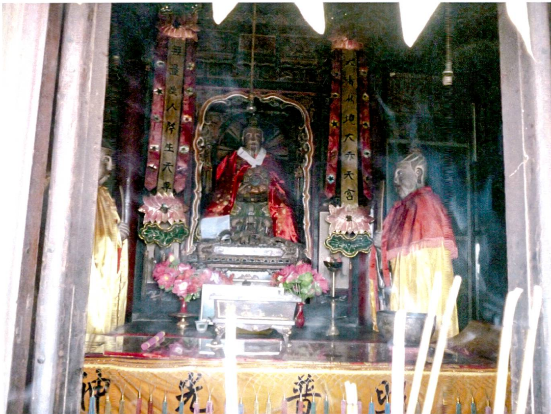
Illustration 2: Statue of the Laojun in Taishang lou temple on Kongtong shan.

himself “revealer” as he could read the thoughts of the ex-Taoist and exposed the “disbelief” which continued to influence the proselyte. 166