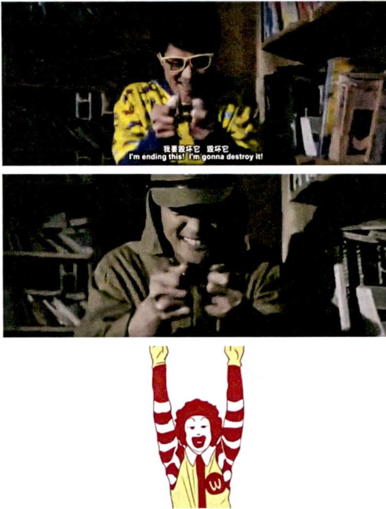
Figure 3: “Redundant” display of multiple images.

generation”, to act the lead role. 26 This is revealing about strategies of the investors and filmmakers in tapping into cinema’s connections with broader media networks.