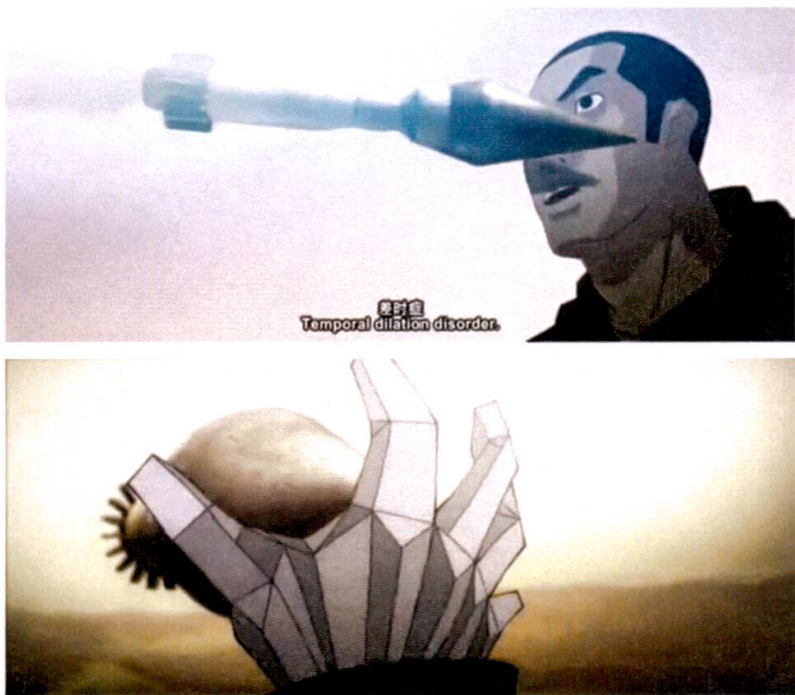
Figure 2: Bullet time.

This “bullet time” indeed appears in Lee’s adventures later when he is fighting in Afghanistan: the bullet is literally slowed down from his perspective so that he can catch the bullet with one hand, even though the bullet flies by in less than one second according to the standard time. (Figure 2) The scene thus reflects the cinematic adoption of gaming time, although technologically, this bullet time of gaming, as Galloway points out, relies on an old medium of still photography.