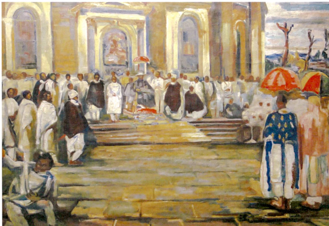
Figure 6: Mohamed Naghi, Palm Sunday in Abyssinia , oil on canvas, 79 × 151 cm, 1932.

government regarding the presence of its military troops in the country. This was the beginning of the artists' so-called "Abyssinian period", a prolific production characterized by vivid light and warm colours inspired by Ethiopian landscapes. It appears that during that time Naghi was more focused on his artistic production than on conducting diplomatic affairs. He painted works representing scenes of Ethiopian daily and court life, including several portraits of the Negus Haile Selassie (Figure 6). 41