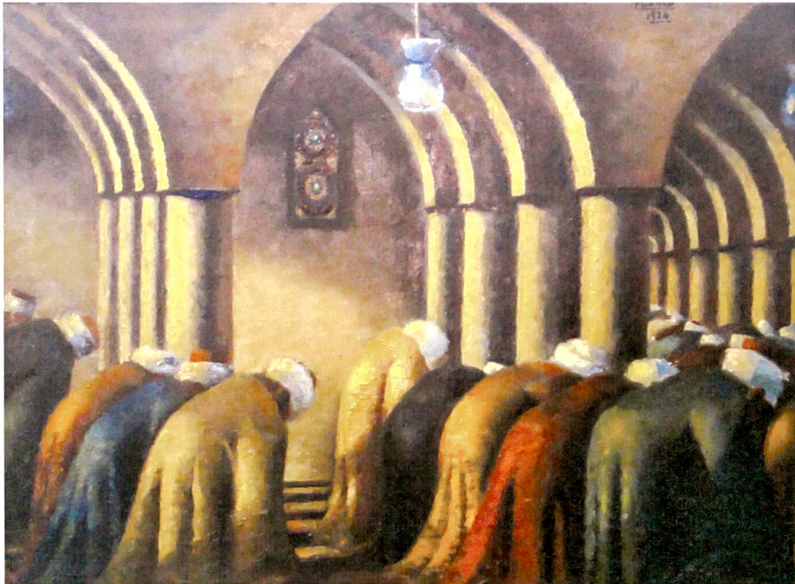
Figure 2: Mahmoud Saïd, Prayer , oil on plywood, 58 × 79 cm, 1934.

expressed his profound admiration for the Italian Primitives as well as the influence of the Venetian Renaissance on his paintings (Figure 2). 28