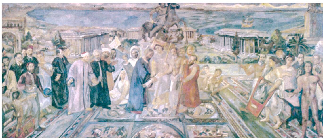
Figure 7: Mohamed Naghi, The School of Alexandria , 700 × 300 cm, oil on canvas, 1952.

Naghi paid tribute to Marinetti in one of his major works entitled The School of Alexandria , which he had begun to paint one year after the Venice Biennale in 1939 (Figure 7). This large allegoric painting was one of the most ambitious works of his career, as he had worked on it for more than ten years, taking it with him on his diplomatic travels, including his journey to Italy where he was the attaché to the Royal Legation in Rome. He finally completed it in 1952 towards the end of his life in his studio located close to the Pyramids of Giza.