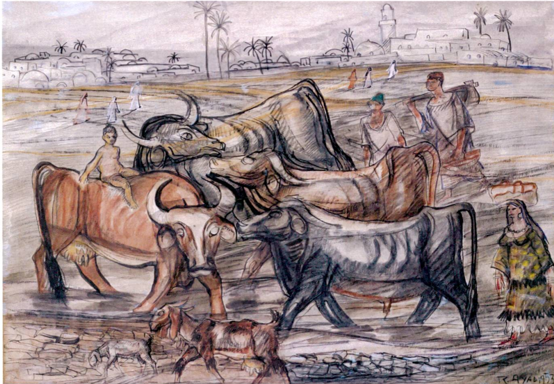
Figure 5: Ragheb Ayad, The Field , ink and watercolour on paper, 1954.

his depictions of the peasants' daily lives (Figure 5). 37 All of them however remained connected to Italy throughout their career and would regularly return to their host country.