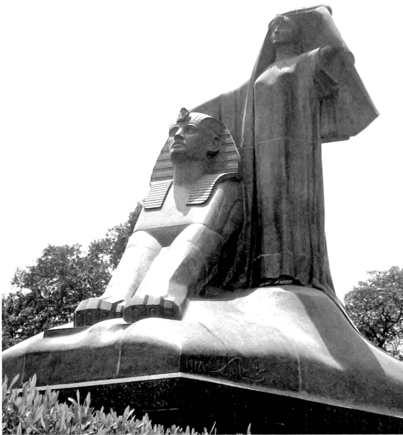
Illustration 6: Mahmud Mukhtar, Egypt's Awakening , 1928 © Elka M. Correa Calleja.

dead of the First World War. The name of the statue was La France and would ornate a one hundred meter tower called La Grave that celebrated the entry of the United States into the conflict. After some difficulties, the project was assigned to Bourdelle. In complete harmony with the ideal of the return to the classical order, the sculptor conceived a statue for the celebration of peace. Bourdelle was the “man of the moment”, because his artworks would help rebuild French culture whose main values had been questioned during the war. His statues incarnated positive values such as liberty or victory and placed the state as the Guardian of Peace (Illustration 6). 31