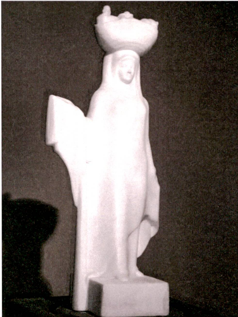
Illustration 5: Mahmud Mukhtar, Return From the Market , 1928 © Elka M. Correa Calleja.

intermingling of the different peoples and cultures, 30 where identity is no longer singular but becomes multiple. In Mukhtar's case, not only the Pharaonic past is recalled, but also Egypt is linked with a broader Mediterranean identity that shares symbols, history and a way of life.