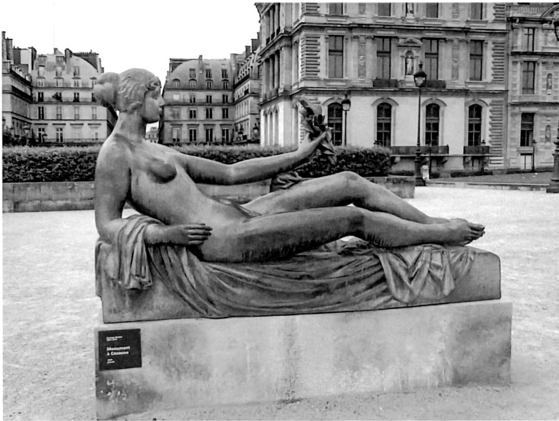
Illustration 9: Aristide Maillol, Monument à Cézanne , 1912–1925