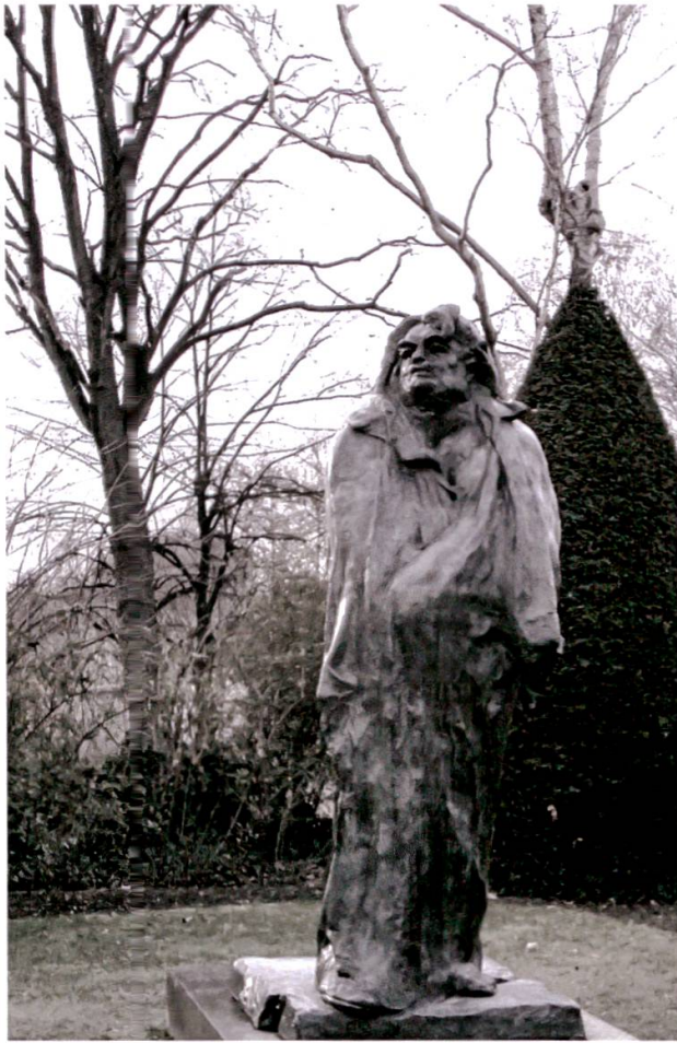
Illustration 4: Auguste Rodin, Balzac, 1891–1897