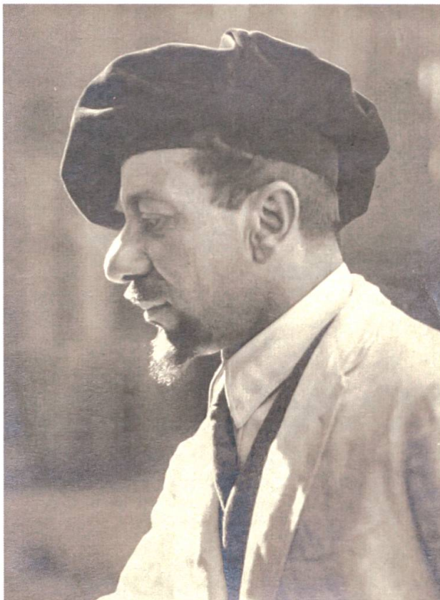
Illustration 1: Mahmud Mukhtar