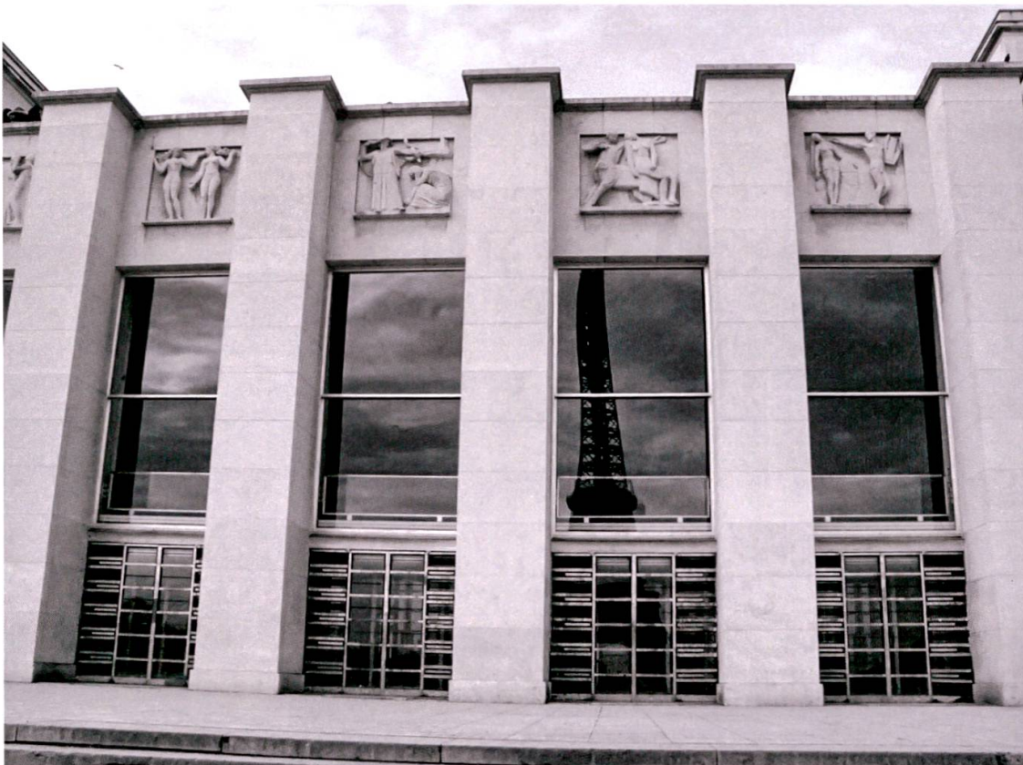
Illustration 7: Emile-Antoine Bourdelle, Théâtre des Champs-Élysées, 1911–1913