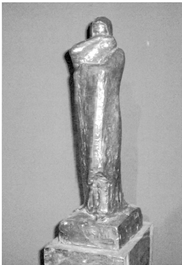
Illustration 3: Mahmud Mukhtar, When Meeting the Men, 1929

and managed to be first in the drawing test, 6 he failed the architecture test. 7 Consequently, he became a temporary student. This conditional admission could be changed a “definitive” one if he succeeded in winning three medals or honorific mentions in contests of which he already had won one. Nevertheless, historical events would impinge on Mukhtar’s future. On June 28 th , 1914, Gavrilo Princip, a Serb nationalist, killed the Archduke of Austria and heir to the Hapsburg throne, Franz Ferdinand. Mukhtar was in Paris when on August 3 rd , 1914 Germany declared war on France. Mobilizations to the front started and the School of Fine Arts was deserted. In the midst of great indecision, Mukhtar was sent back to Egypt 8 but shortly returned to France.