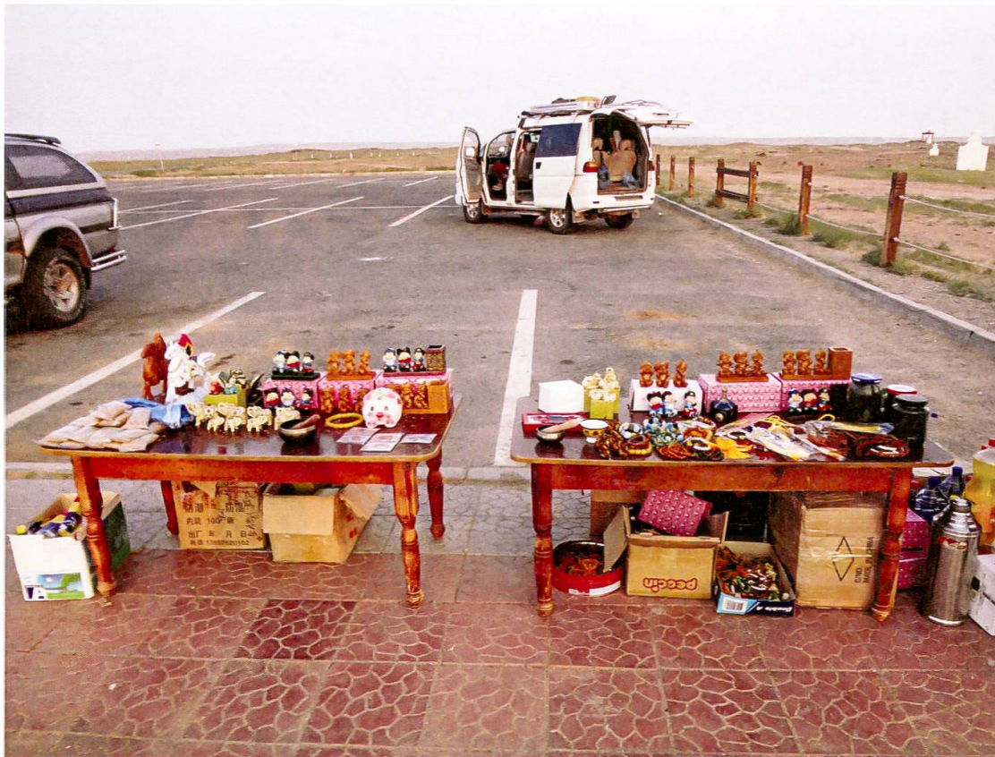
Figure 5: Souvenirs.

plastic wind horses (Mo. khii mori ), a couple of white stone elephants and other regalia considered to be particularly auspicious (Figure 5). At the ger camps, however, religious souvenirs are sold at a larger scale.