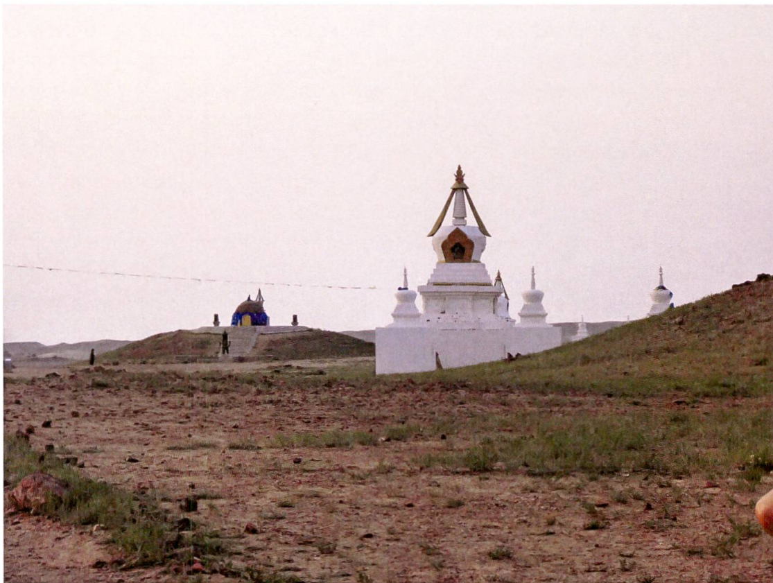
Figure 6: Tarkhi ovoo.

depression called “The stomach of the hungry ghost”. At that spot, the pilgrims should burn previously prepared papers on which they have listed their non-auspicious deeds in this lifetime. A bit further in the square, they come to three small rock cairns building a diagonal line. The rocks point to Bayanzurkh Uul, the sacred mountain of the Third Noyon Khutagt. Here the pilgrims offer vodka. They will finally reach the most sacred part of the Shambhala Energy Centre, a small round hill on whose top is the Tarkhi Ovoo (Figure 6). The hill itself resembles a kapāla , a skull-cup used in tantric ritual, upon which an oboo is placed. The pilgrims circumambulate the oboo , all the while reciting wish-prayers to be reborn in Shambhala after death.