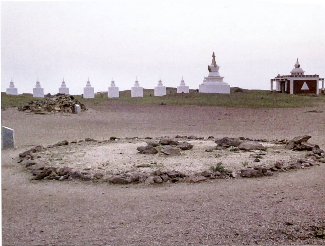
Figure 4: The Shambhala Energy Centre.

Sukhāvātī or Potala , but in one important aspect Shambhala differs from them. It includes an apocalyptic vision of a future battle between the last kalki of Shambhala, Raudracakrin, and the ruler of the infidels (Tib. kla klo , Mo. lalo ). 79 One of the earliest Tibetan texts to deal with the kingdom of Shambhala, the sDom pa gsum gyi rab tu dbye ba of the Sa skya paṇḍita Kun dga' rgyal mtshan (1182–1251), describes the battle and its outcome thus: