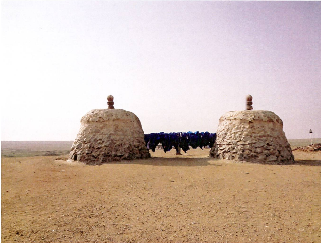
Figure 3: The “breast oboo”.

Buddhism. 75 Not far from the temple complex, some two to three kilometres to the north-east, a site dedicated to the realm of Shambhala was built. The site in the form of a maṇḍala is surrounded by 108 76 stūpas (Figure 4). Danzan Ravjaa had a special affinity to the mythical realm of Shambhala that is closely connected to the Kālacakra tantra . 77 According to this tantra and other Tibetan sources 78 the mythical country of Shambhala lies somewhere north of the Himalayas and north of the mythical river Sitā. The country has the form of an eight-petalled lotus, which is surrounded by two ranges of snow-mountains. According to Tibetan and Mongolian Buddhist tradition, in Shambhala no evil is known, its people are naturally virtuous and good. Most of them obtain Buddhahood during their lifespan in Shambhala. Once somebody is born in this realm, he will never be reborn into a lower form of existence. This description shows close affinities to Buddhist concepts like the Buddha fields of