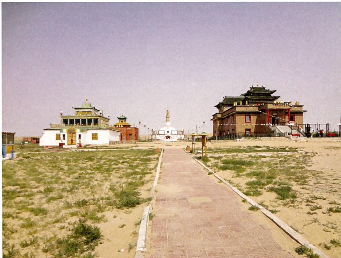
Figure 1: The yellow and red temple.