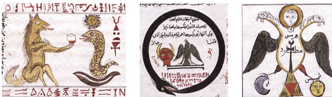
Dog and Ouroboros, Ouroboros, many-faced monster, Gotha Research Library of the University of Erfurt, Ms. orient. A 1261, fol. 8b, 6a, 19b.

This black dog, who holds the goblet in which serpents and dragons swim, is presented in a drawing in Kitāb al-Aqālīm al-sab‘a (The Book of Seven Climes), ascribed to al-Sīmāwī. The same applies to the many-faced monster and the ouroboros .