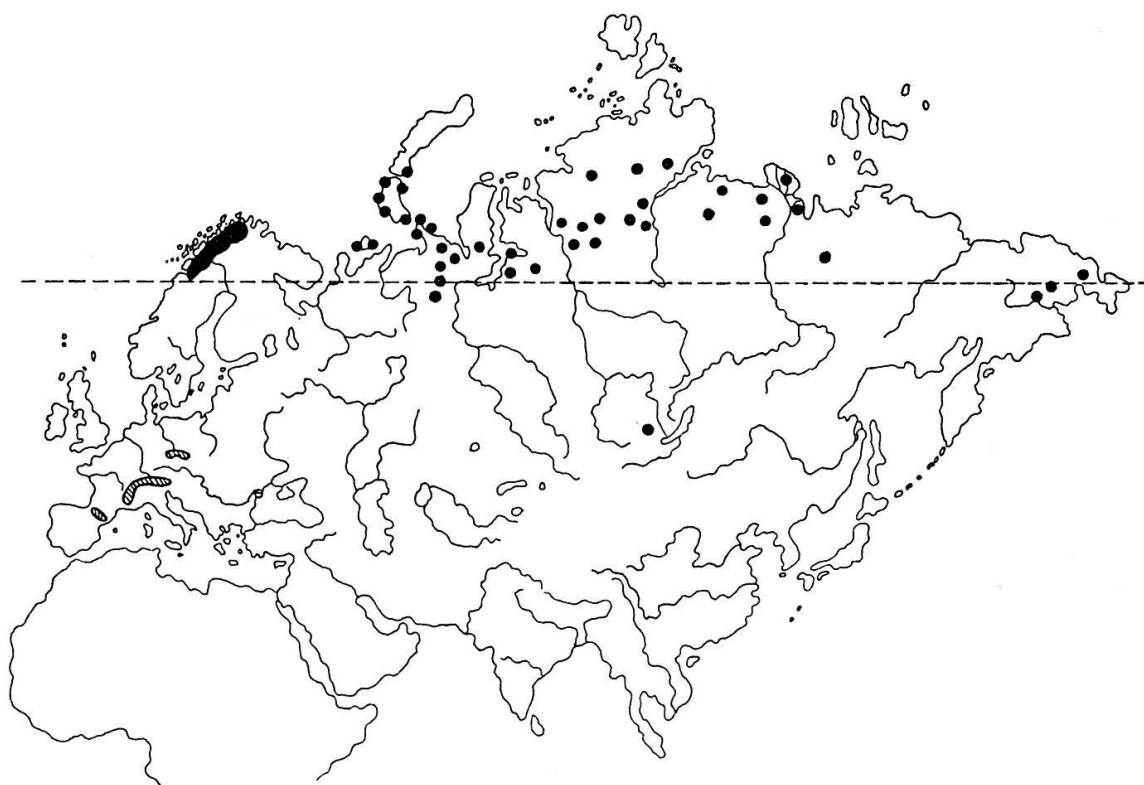
Fig. 23. Distribution of Antennaria villifera Boriss. and A. carpatica (Wahlenb.) Bluff et Fingerh. s.str. in Europe and Asia.