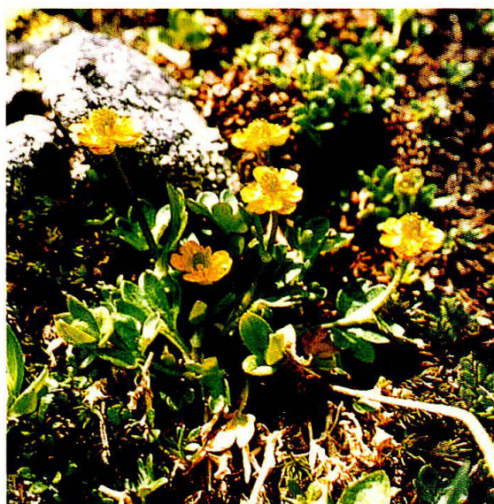
Fig. 3. Ranunculus pygmaeus is about 5 cm tall, leaves are three to five lobed, flowers yellow. It is diploid, produces no runners and reproduces only by seeds. Ranunculus pygmaeus is circumpolar distributed with one relict population in the Swiss Alps and several populations in the Austrian and Italian Alps.