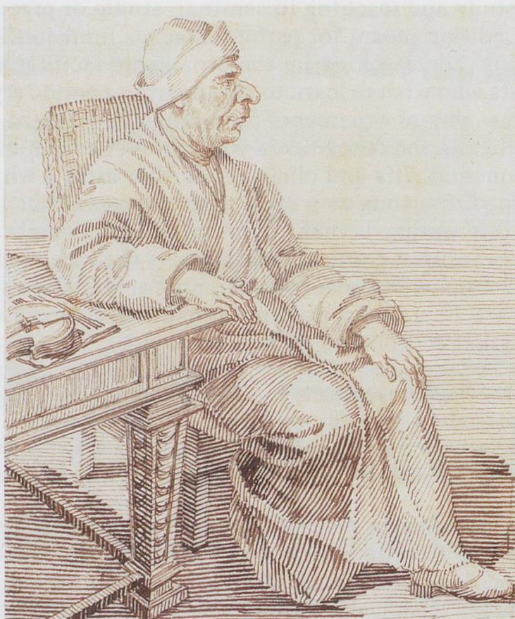
Fig. 2: Caricature of Giovanni Battista Tibaldi by Pier Leone Ghezzi (see n. 17).

Consider, for instance, an inscription by Pier Leone Ghezzi on his caricature (1720) of the Roman violinist and composer, Giovanni Battista Tibaldi (see Fig. 2), who played under Corelli for some years and may even have studied with him: Tibaldi sonator di violino, il quale in tempo di Arcangelo Corelli faceva la sua figura, ma presentemente non è più chiamato alle musiche perché sona all'antica. 17 That poor Tibaldi was so far out of fashion a mere seven years after Corelli's death suggests a striking rate of change in performance styles – styles that the careless use of such expressions as „in the baroque style“ may too easily suggest were more monolithic and stable than they ever could have been.