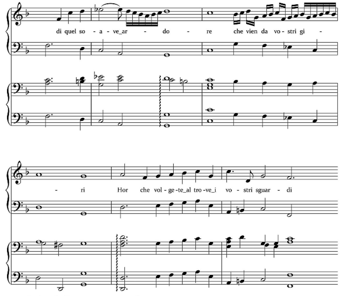
Ex. 3: Occhi soli d'amore, p. 4, second stave.