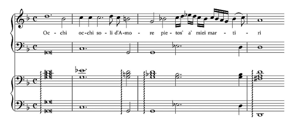
Ex. 2: Occhi soli d'amore, p. 4, beginning.