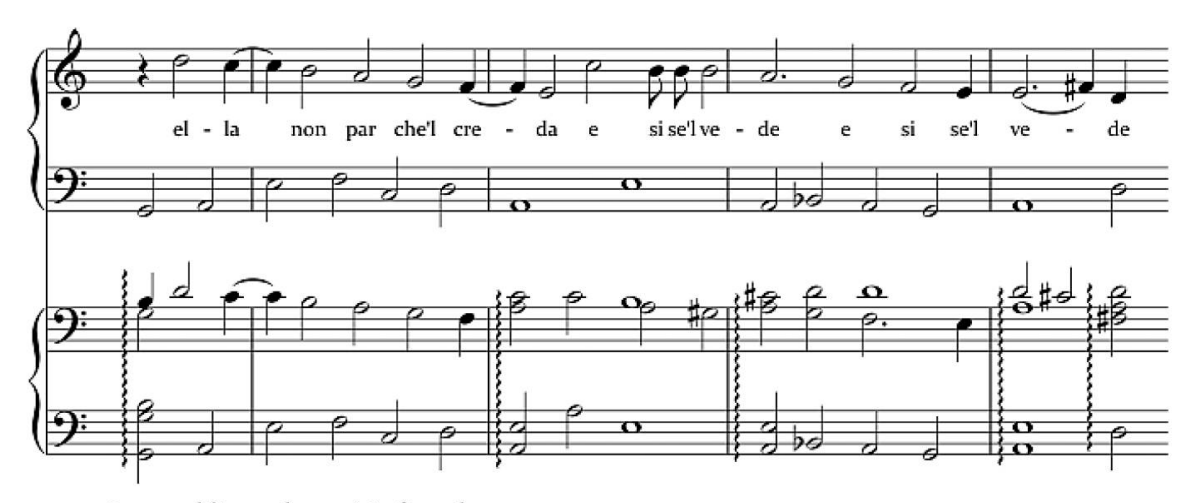
Ex. 10: Lasso ch'io ardo, p. 11, fourth stave.