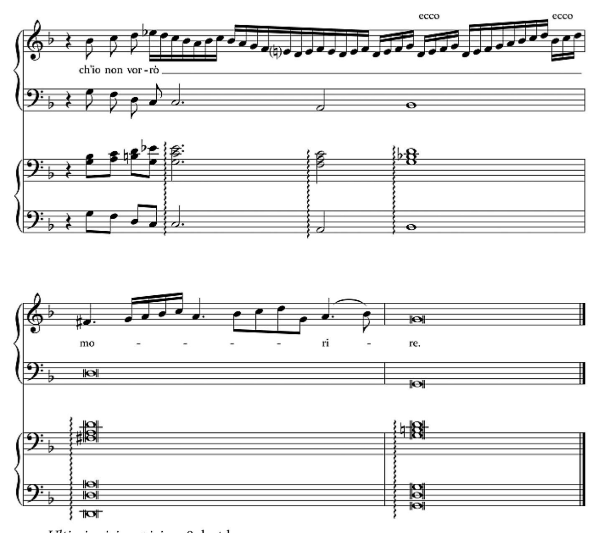
Ex. 8: Ultimi miei sospiri , p. 8, last bars.