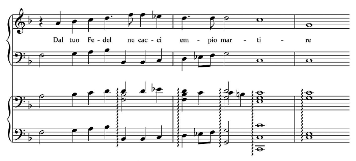
Ex. 7: Ultimi miei sospiri, p. 8, third stave.