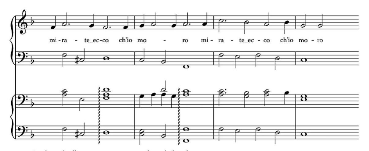
Ex. 5: Occhi soli d'amore, p. 5, second and third stave.