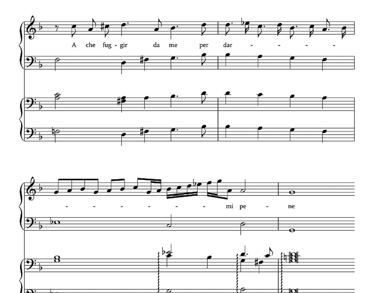
Ex. 9: Se la mia vita sete, p. 9, third and fourth stave.