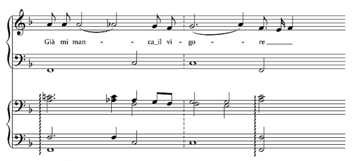
Ex. 4: Occhi soli d'amore, p. 4, fourth stave.