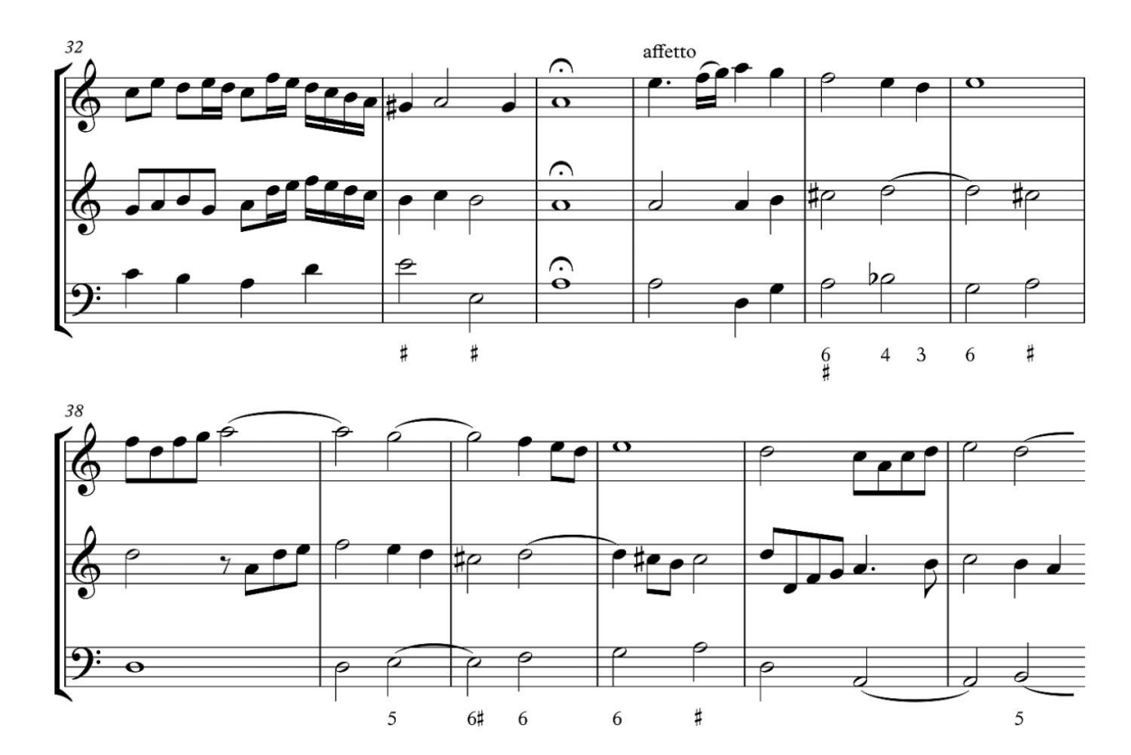
Ex 1: D. Castello: Terza sonata , beginning of the second section, from Sonate concertate in stil moderno . Libro primo , Venice 1621, bars 32–43.

gio Marini,<sup>42</sup> Giuseppe Scarani,<sup>43</sup> and Bartolomé de Selma y Salaverde<sup>44</sup> the word affetto is printed near passages, to emphasize the rendering of certain emotional effects (Ex. 1–5).