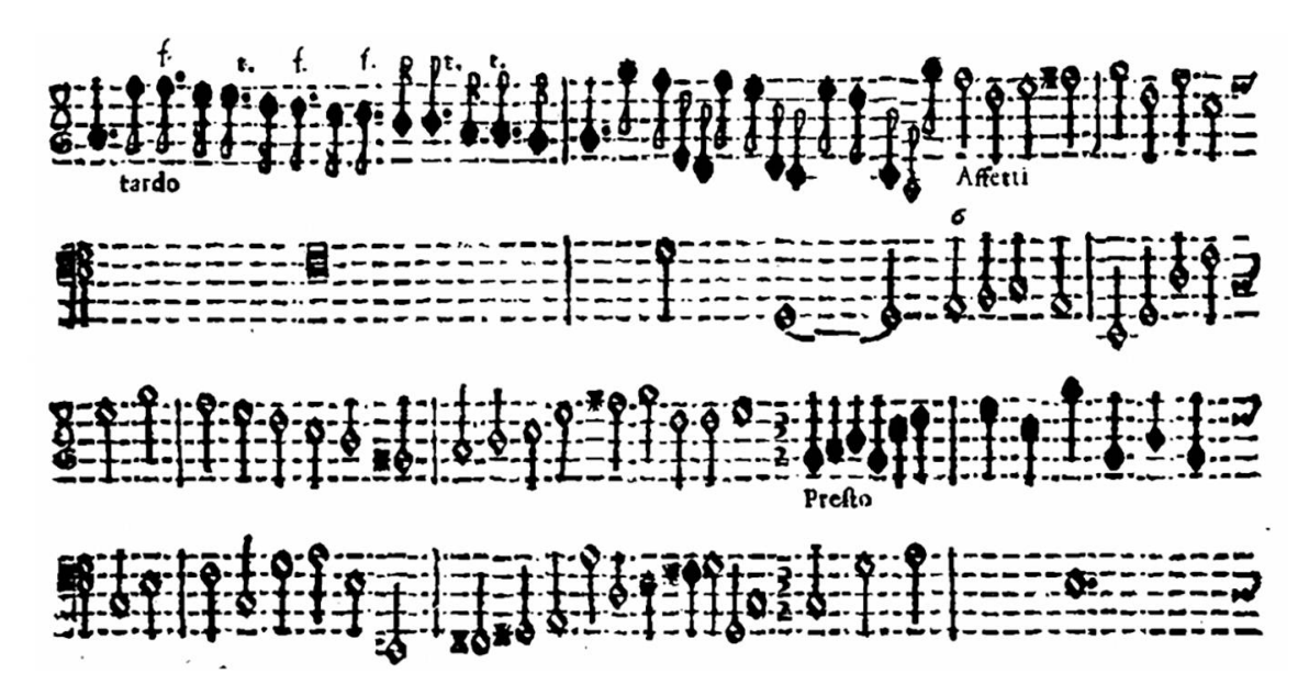
Ex. 2: B. Marini: Sonata IV per sonar due corde, from Sonate, simphonie, canzoni [...] op. VIII (Venice 1626/1629), bars 59–64.