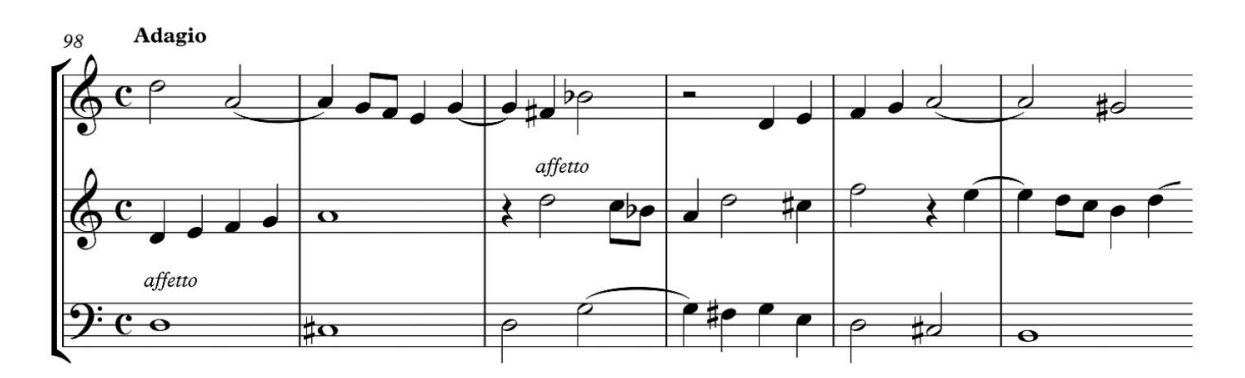
Ex. 3: G. Scarani: Sonata VI, from Sonate concertate (Venice 1630), bars 98–103.

tures as described by Osio,<sup>45</sup> Scala, Perrucci, and others. This enlivens the instrumental performance and highlights the musical instruments themselves, which several of the early seventeenth-century Theatra instrumentorum studied by Rebecca Cypess record, describe, and study principally as mechanical objects of scientific interest.<sup>46</sup> This new professional and aesthetic condition of instrumentalists in this period outlines them as performers not only to listen to, but to watch , like singers and actors.