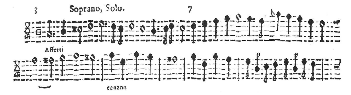
Ex. 5: B. de Selma y Salaverde: Beginning of Canzon terza a soprano solo, from Canzoni, fantasie et correnti (Venice 1638).