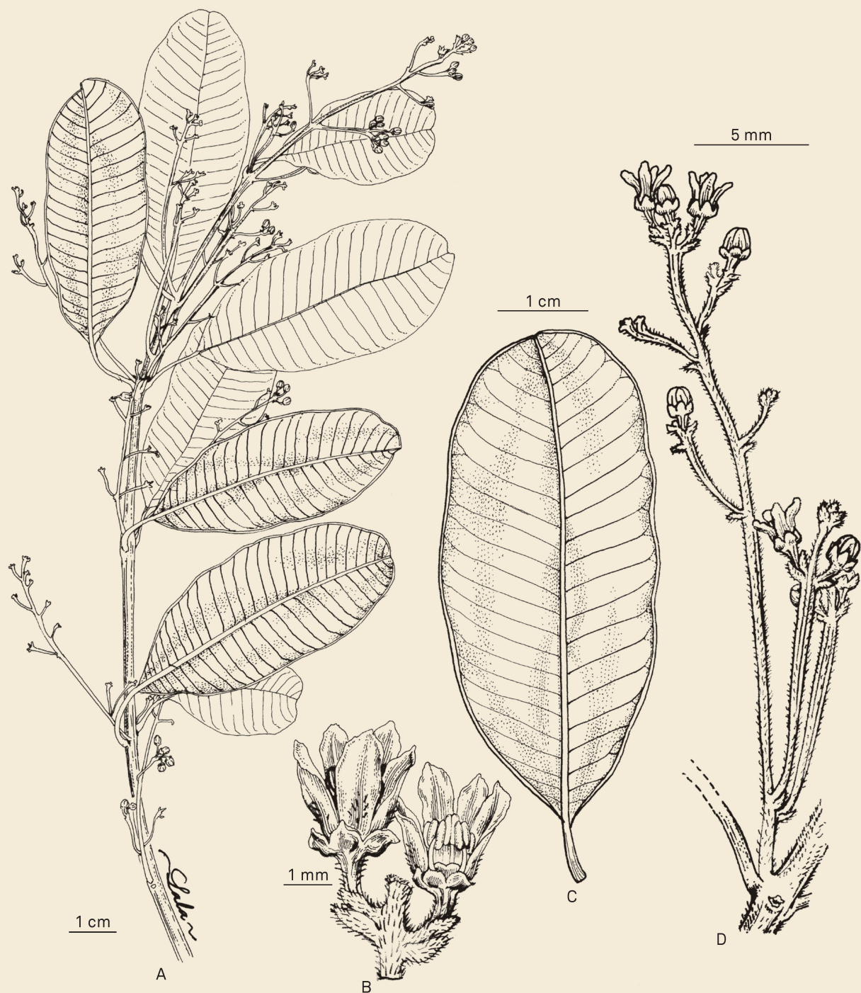
Fig. 4. Abrahamia capuronii Randrian. & Lowry. A. Flowering branch; B. Flowers (one with a petal removed); C. Detail of leaf; D. Inflorescence. [Service Forestier 767, P] Drawings: R.L. Andriamiarisoa