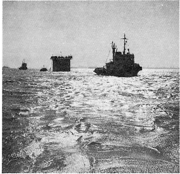
Fig.2 Caissons being towed in sea