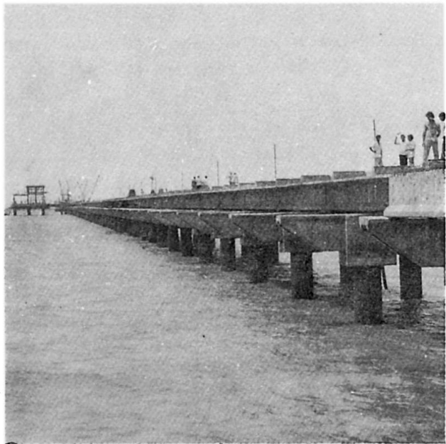
Fig.4 Piled Jetty