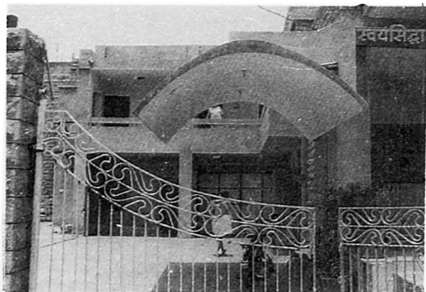
Fig. 2 Front view of hood