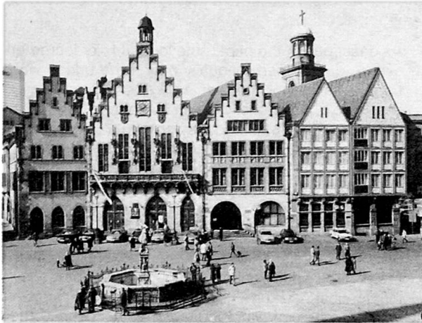
City Hall: Symbol of the City of Frankfurt

Frankfurt, Fed. Rep. of Germany May 12–14, 1986