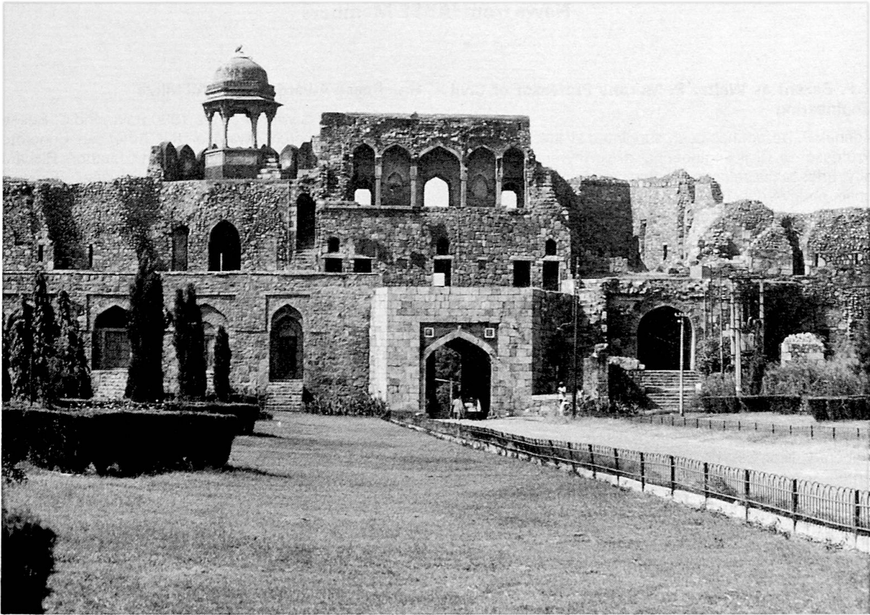
Tombeaux autour du Mausolée d'Humayab