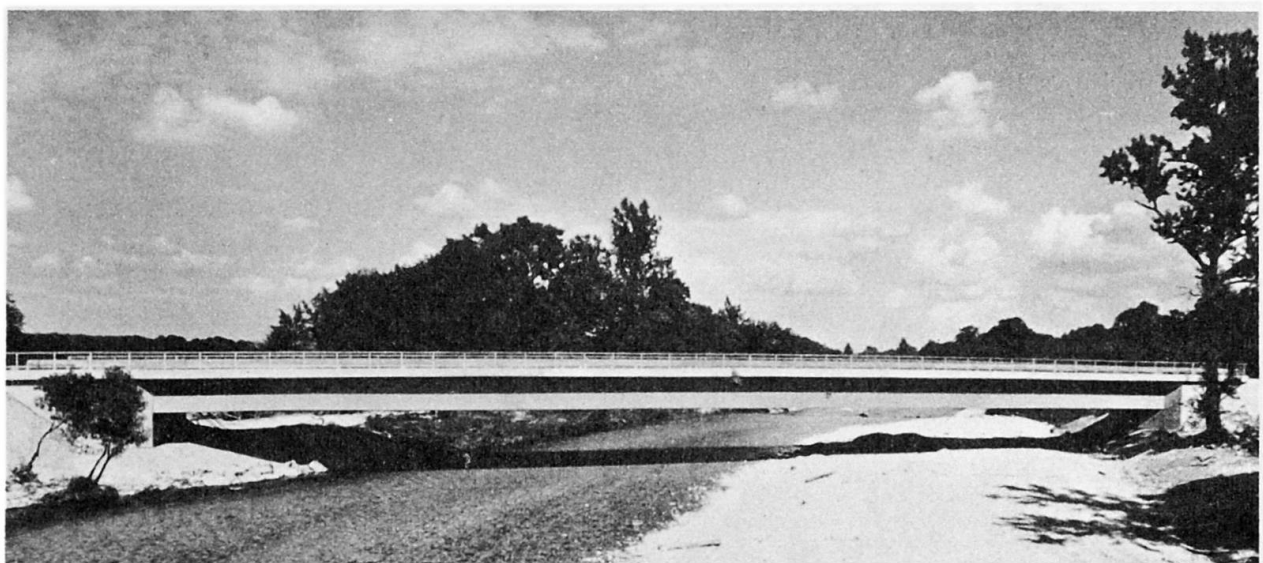
Fig. 2: Completed bridge

The compressed bar (diameter 36 mm S 1080/1320) transfers its force by means of a thread and nut into the anchor plate. The plate is fixed in the beams's concrete by means of 8 buttonheaded cold-drawn stressing steel wires (diameter 12.2 mm, S 1370/1570 with undulated ends). The anchorages of the postcompressed bars have to be placed in such a manner that they cannot push out the surrounding concrete. This is easily done, e.g. by setting the anchorages of the bars between anchorages of tendons. The anchorage used in the Alm bridge is designed for 13.5 MN ultimate load.