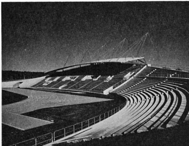
View from inside the stadium showing the grandstand with its cable suspended roof.

The roof consists of a cable-suspended structure with all of the supporting columns located at the rear of the stand to give unobstructed viewing from the seating.