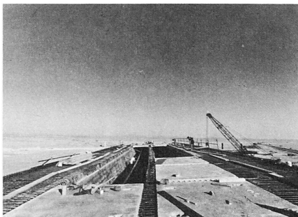
Fig. 4 Placing of the precast deck slab elements after concreting bottom slab and webs and applying a partial prestress