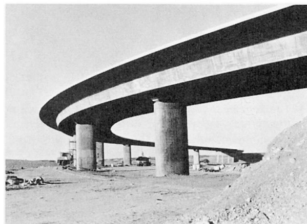
Fig. 2 Nearly completed interchange bridge, before mounting the precast parapet elements

The clear distance between the webs could be made identical for all the different cross-sections. This permitted an economical production of only one type of precast deck slab element.