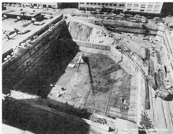
Fig. 3 Mat foundation

The 3 m thick with 11,622 m 3 of concrete was poured in two pours approximately equal in quantity. Because of the physical constraints in constructing such a mat foundation, the placement of the mat was done during weekend and at night between