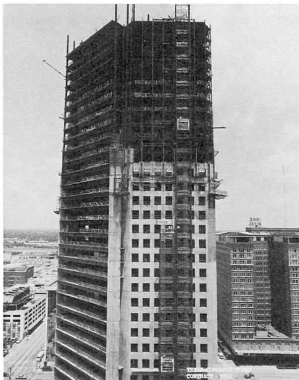
Fig. 4 Construction