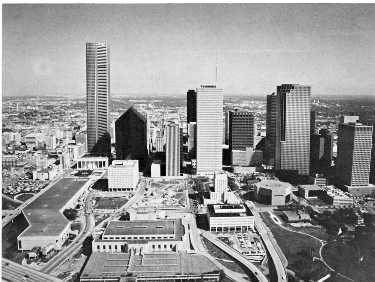
Fig. 1 Houston skyline

The exterior composite system, called a "ruptured tube", is the main element that is used to carry the wind loads for the structure. Since the exterior tube is ruptured at 26 m front face, the "healing" of the rupture is done by continuing lateral load resisting elements toward the core of the building. A concrete shear wall is placed next to the front row of elevators and the connection between the interior shear wall and the exterior tube is a very stiff steel link beam in the floor. The secondary stiffness element is the steel girder that spans 26 m and ties the two