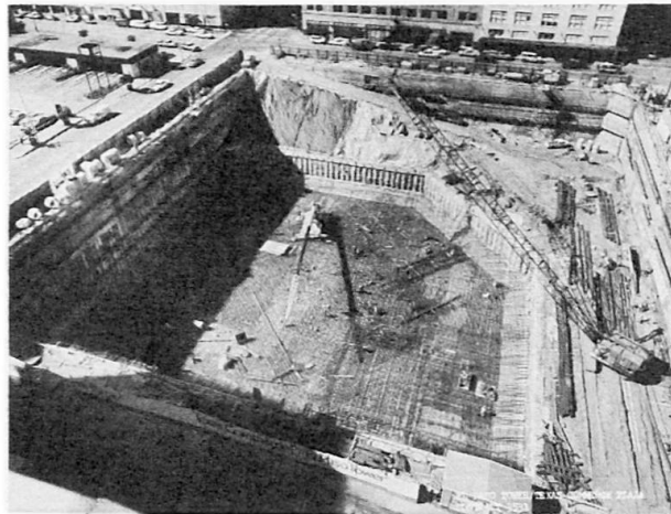
Fig. 3 Mat foundation

The 3 m thick with 11,622 m 3 of concrete was poured in two pours approximately equal in quantity. Because of the physical constraints in constructing such a mat foundation, the placement of the mat was done during weekend and at night between