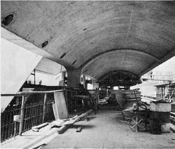
Fig. 2 Side platform and upper tier canopy