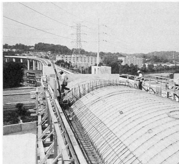
Fig. 4 Upper tier canopy before concreting

Careful coordination was required to avoid interference of posttensioning tendons with mild steel reinforcement, drainage pipes, structural steel weldments which act as seats for track girders, and conduits for lighting and communication. Because the canopy shells, columns and platform grids form a space structure, the sequence of casting and post-tensioning was critical in the successful construction of the station.