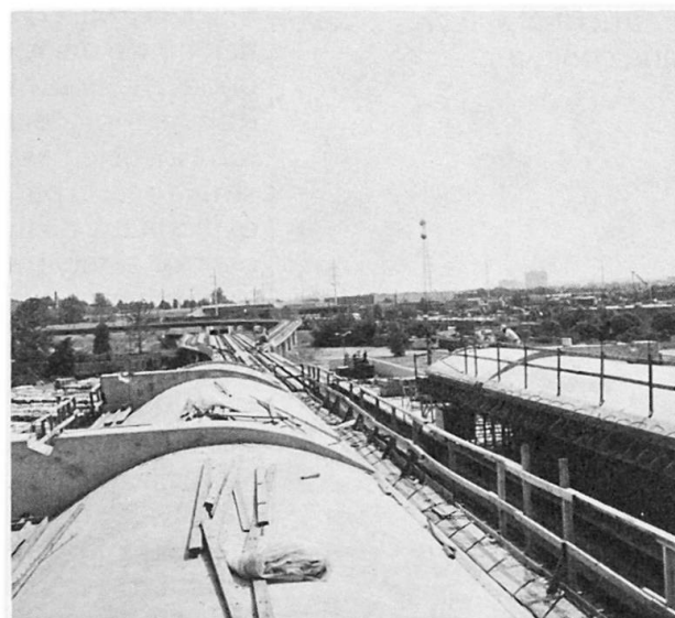
Fig. 5 Upper tier canopy after concreting