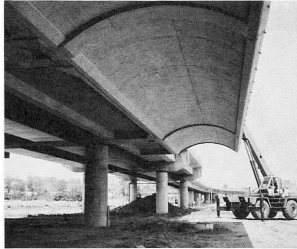
Fig. 3 Canopy over sidewalk

opies with supporting columns located at the outside edges of the platforms. For widened portions of platforms, leading to escalators which rise from street level, double-cantilever (gull wing) canopies are used, supported by center columns. The escalators are covered by sloping canopies, and sidewalks at street level are covered by canopies at the level of the pier cap beams. All canopy columns of the upper tier are framed into the ends of piers cap beams and the ribs of sidewalk canopies extend out from the ends of pier cap beams.