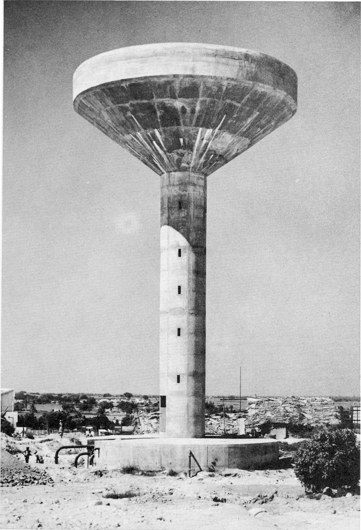
Water tank with ferro-cement suspended shell roof near Bangalore